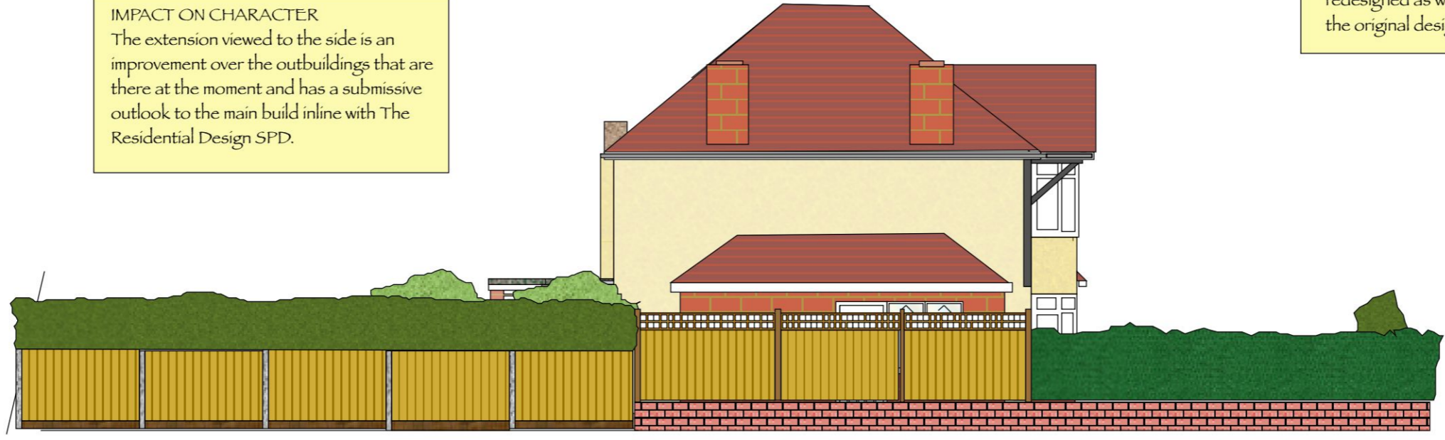
SIDE ELEVATION from Devon Way

IMPACT ON CHARACTER The extension viewed to the side is an improvement over the outbuildings that are there at the moment and has a submissive outlook to the main build inline with The Residential Design SPD.