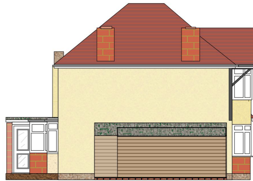
SIDE ELEVATION from Devon Way