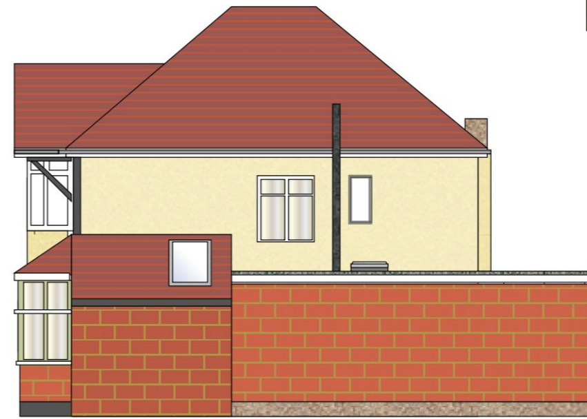
SIDE ELEVATION from 107