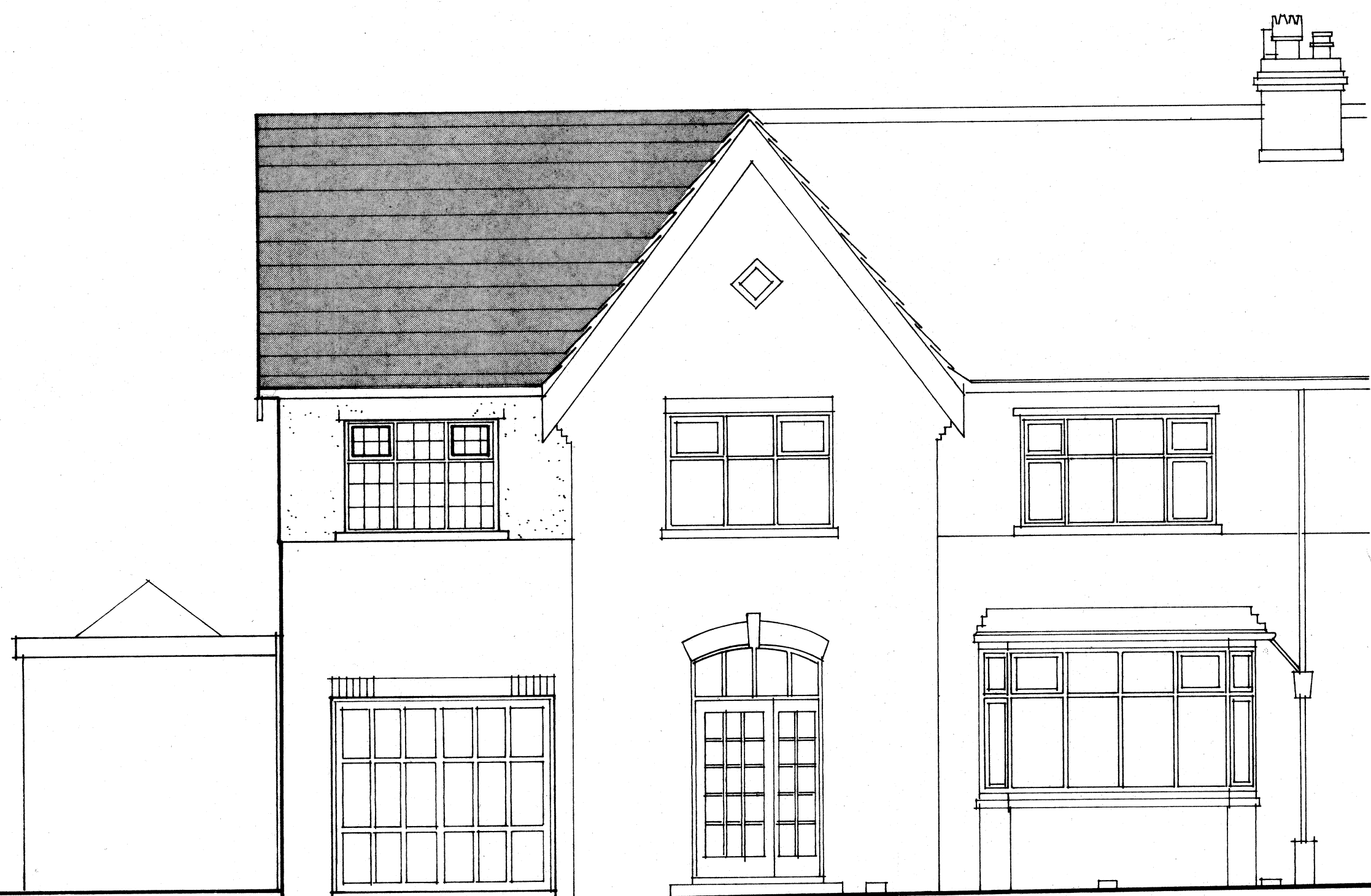
elevation to regent road