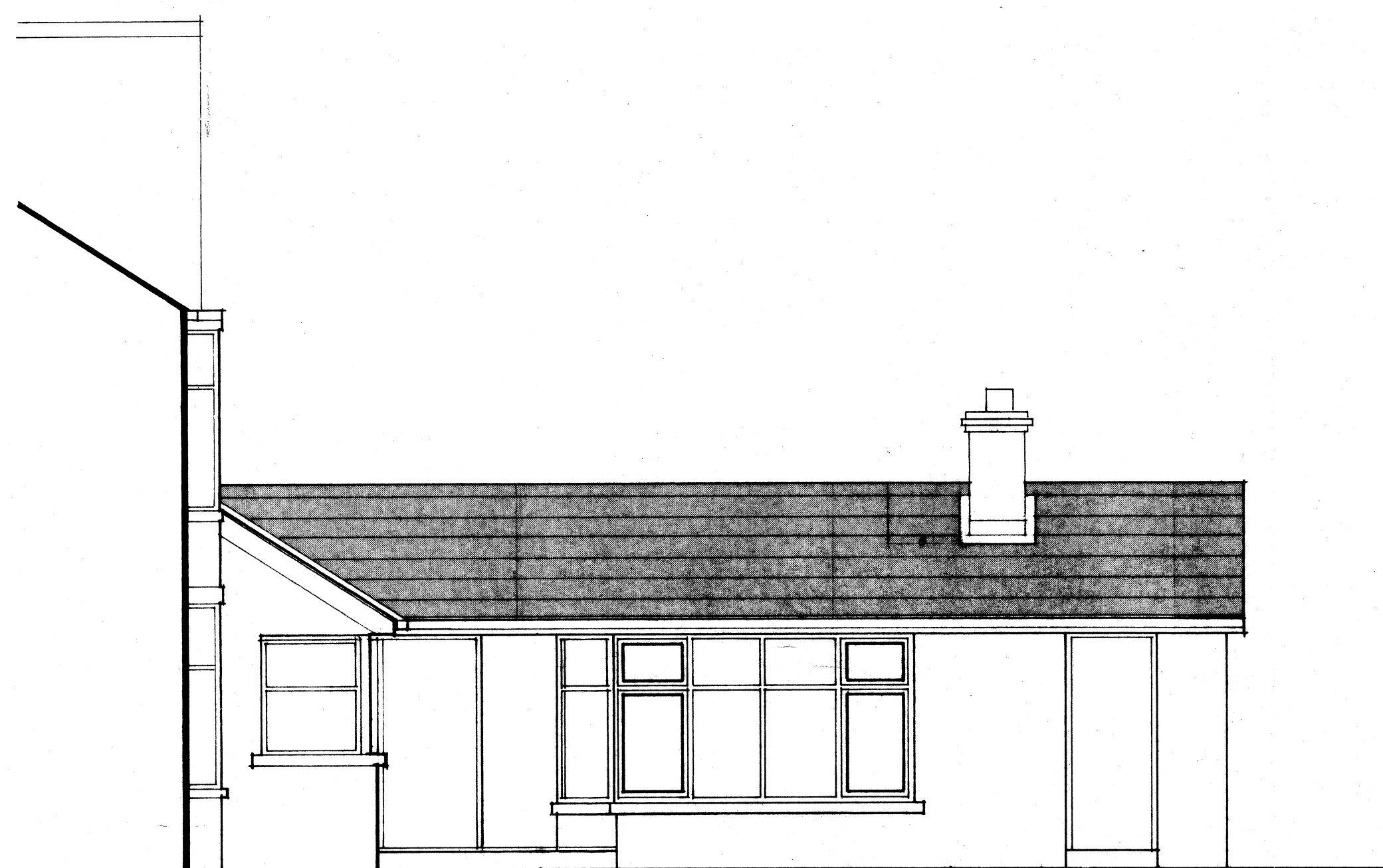
side elevation to garden