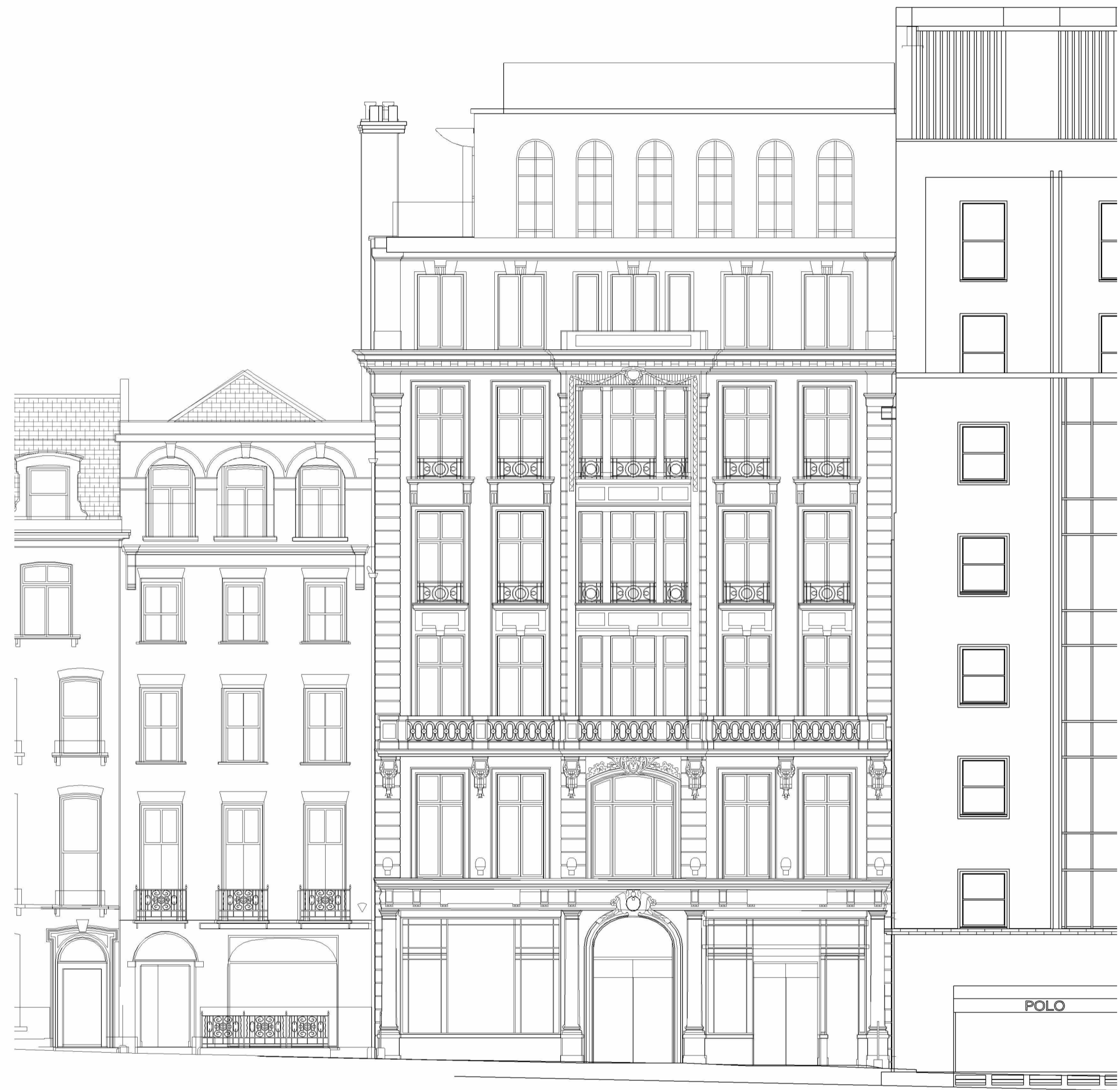
1 01-ELEV - North West Elevation 1 : 100