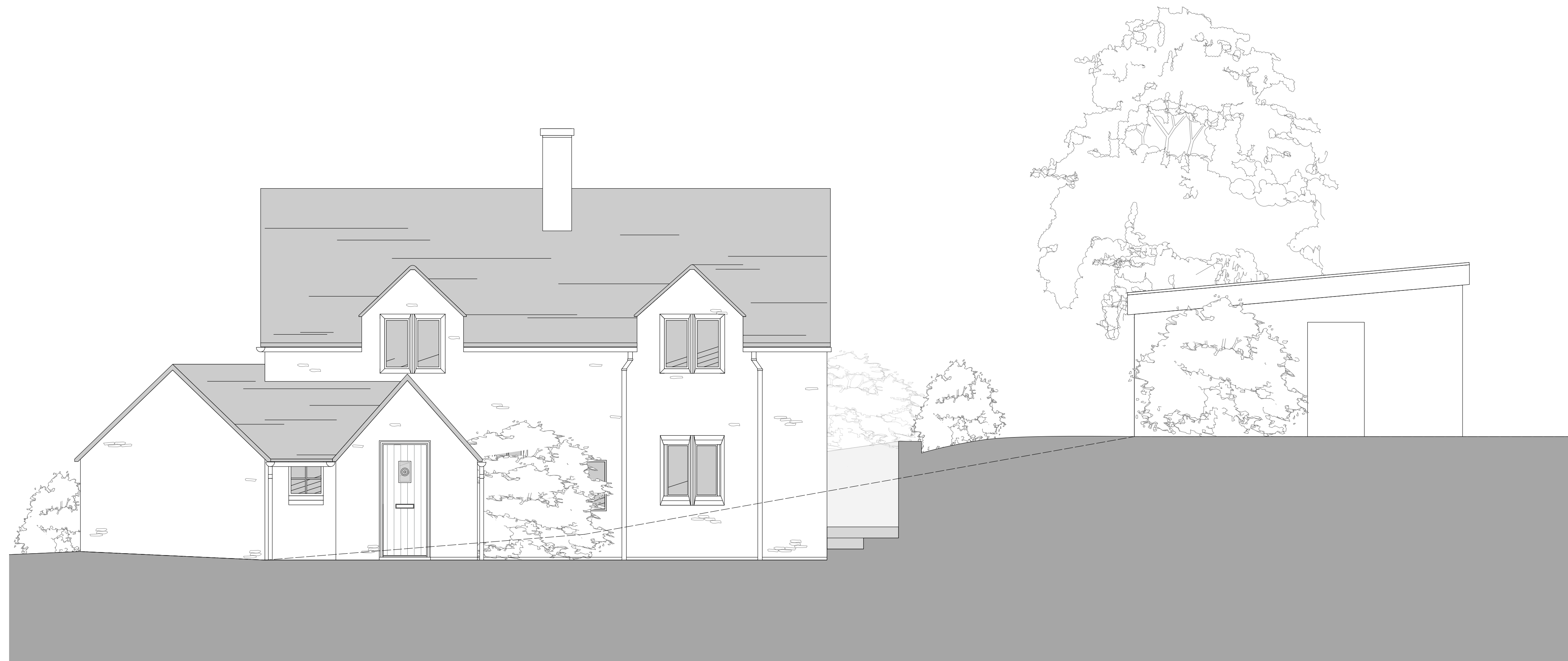
1 Existing North Garage Elevation 1:50 @ A1/ 1:100 @ A3