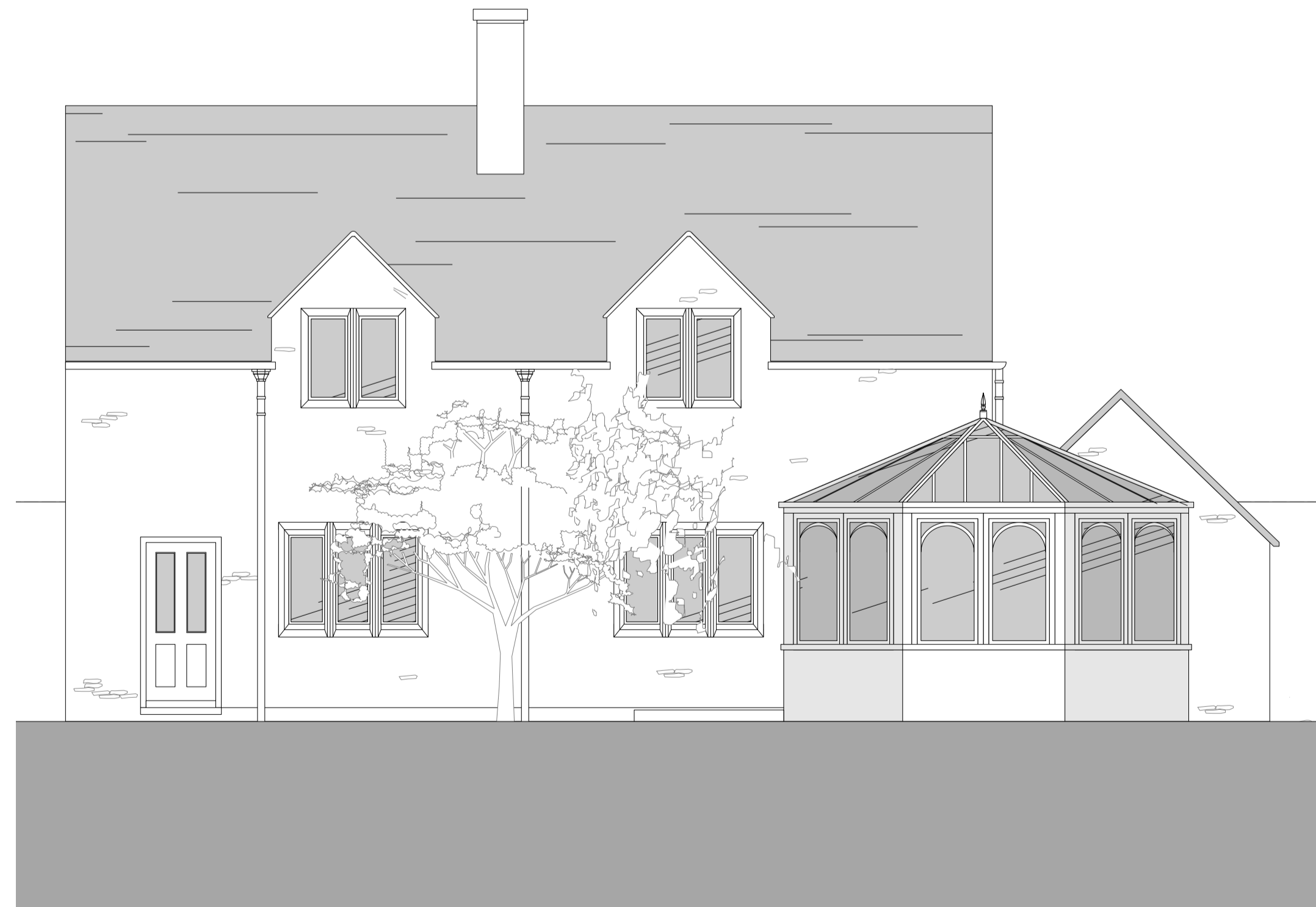
3 Existing South Elevation 1:50 @ A1/ 1:100 @ A3