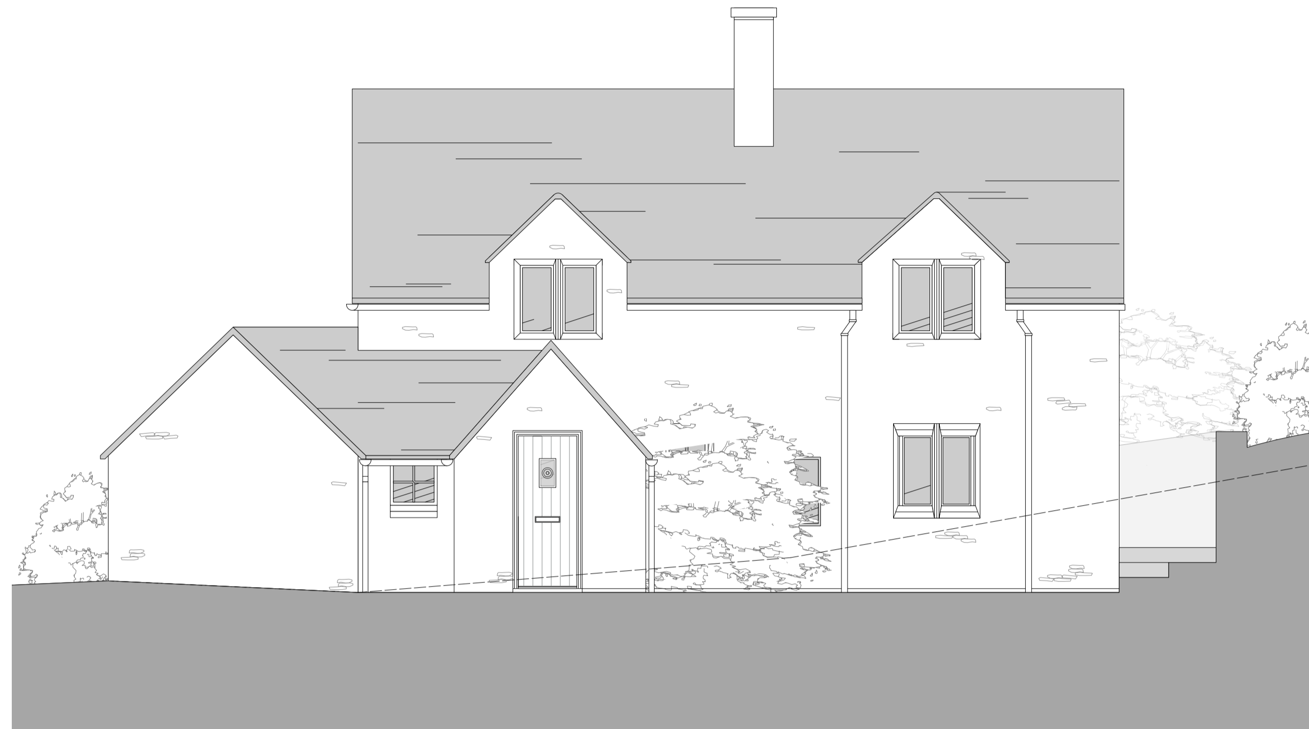
1 Existing North Elevation 1:50 @ A1/ 1:100 @ A3