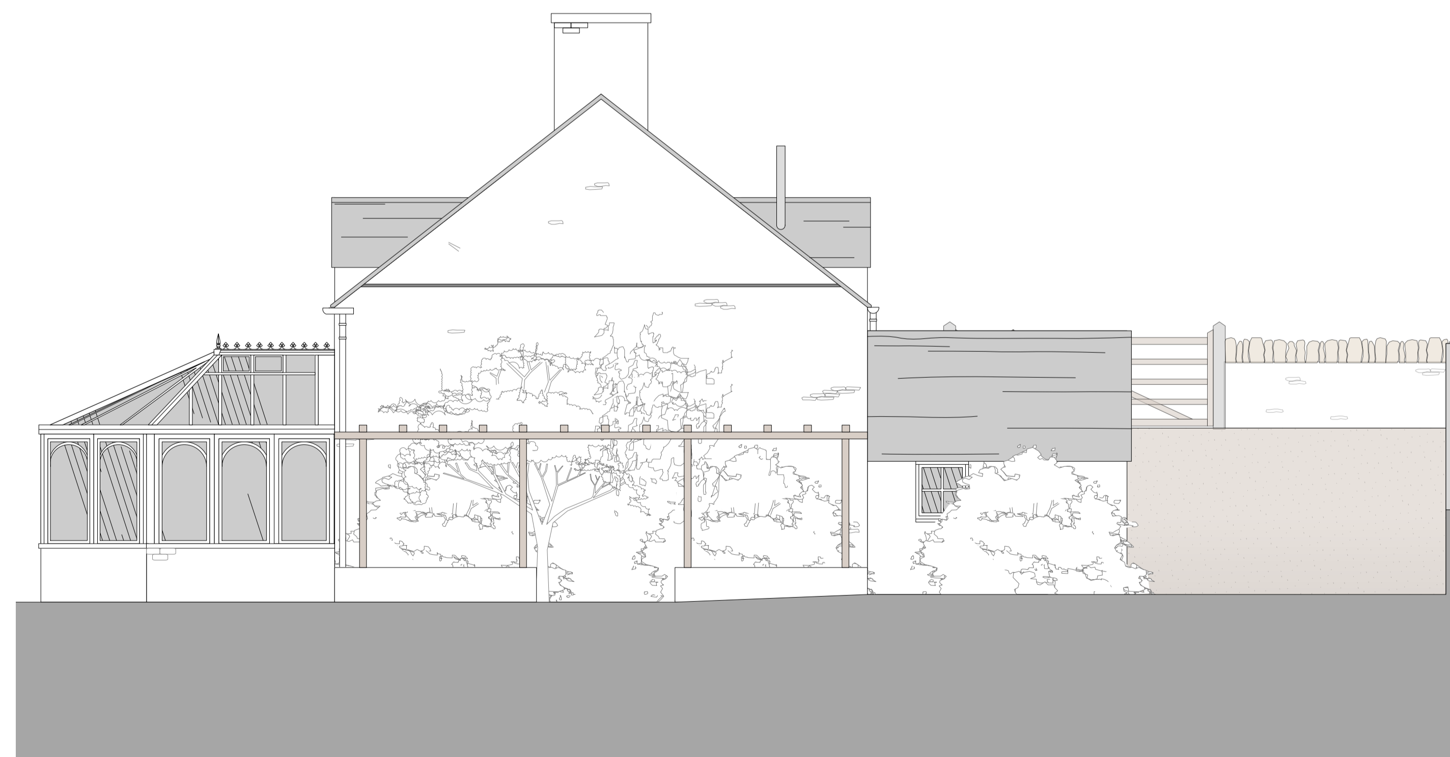
4 Existing East Elevation 1:50 @ A1/ 1:100 @ A3