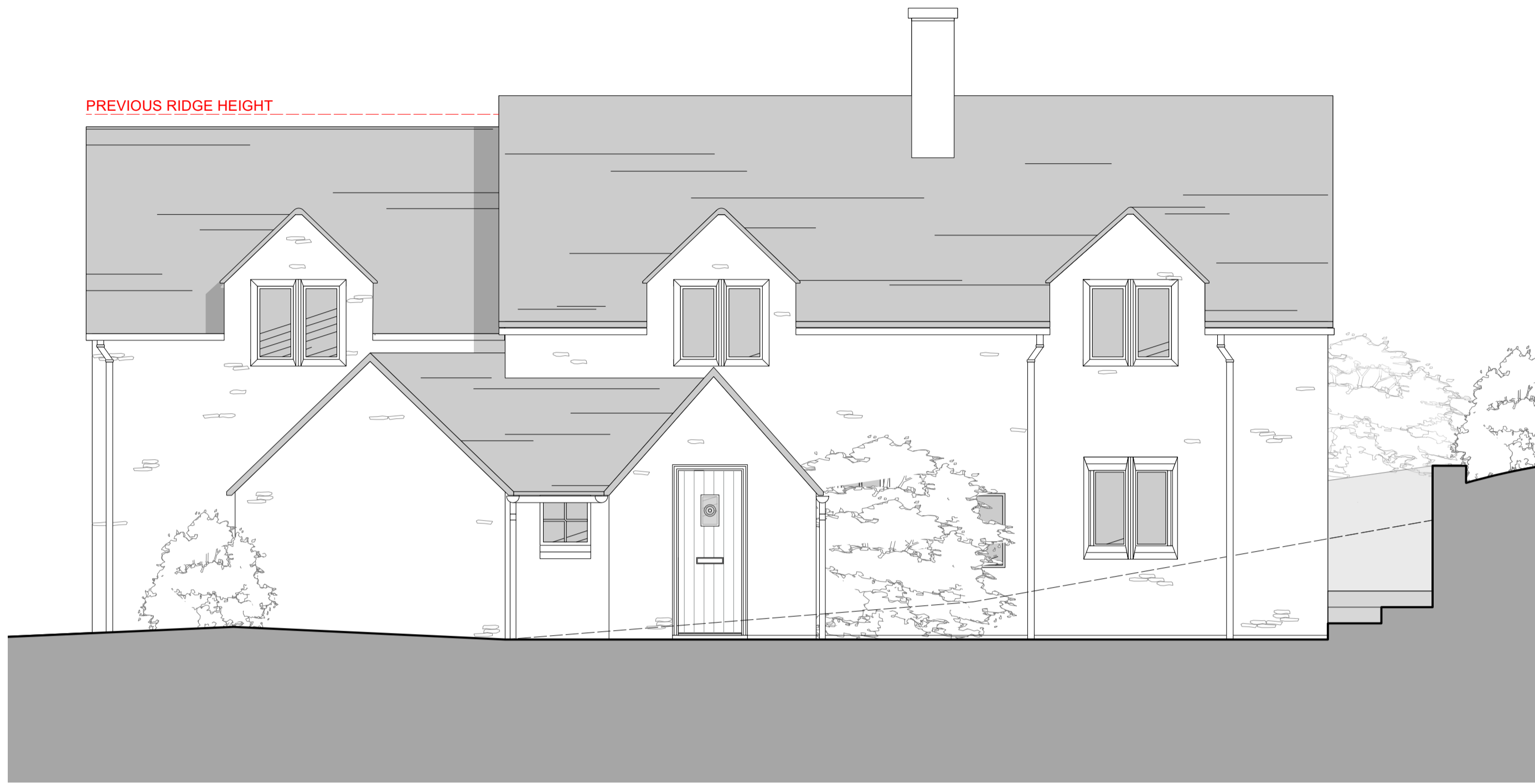
1 Proposed North Elevation 1:50 @ A1/ 1:100 @ A3