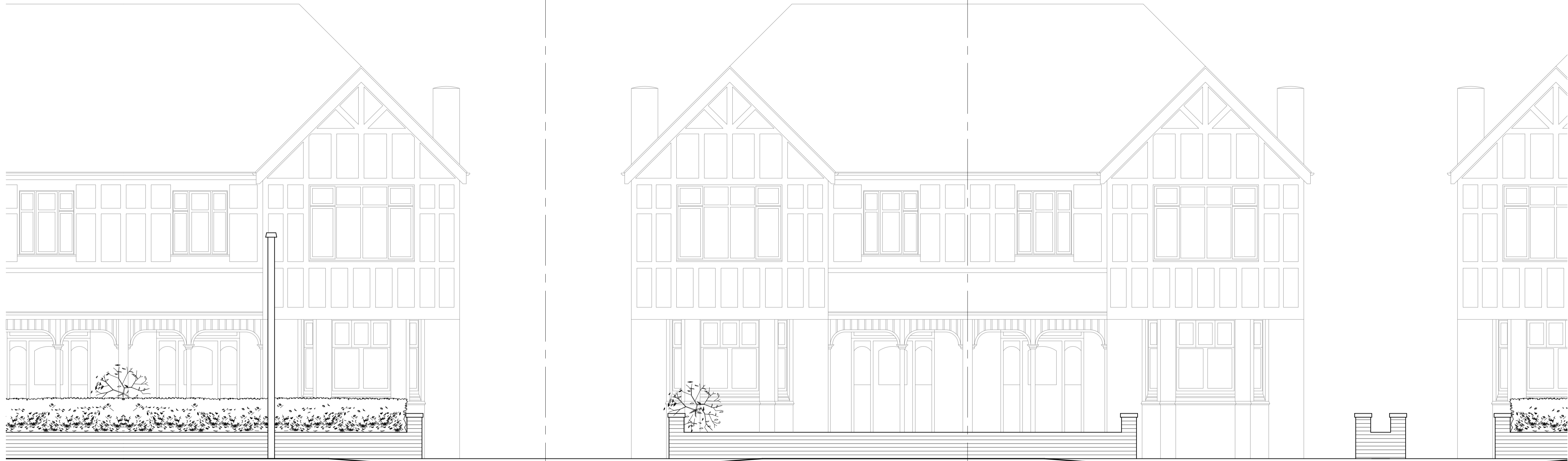
EXISTING STREET SCENE