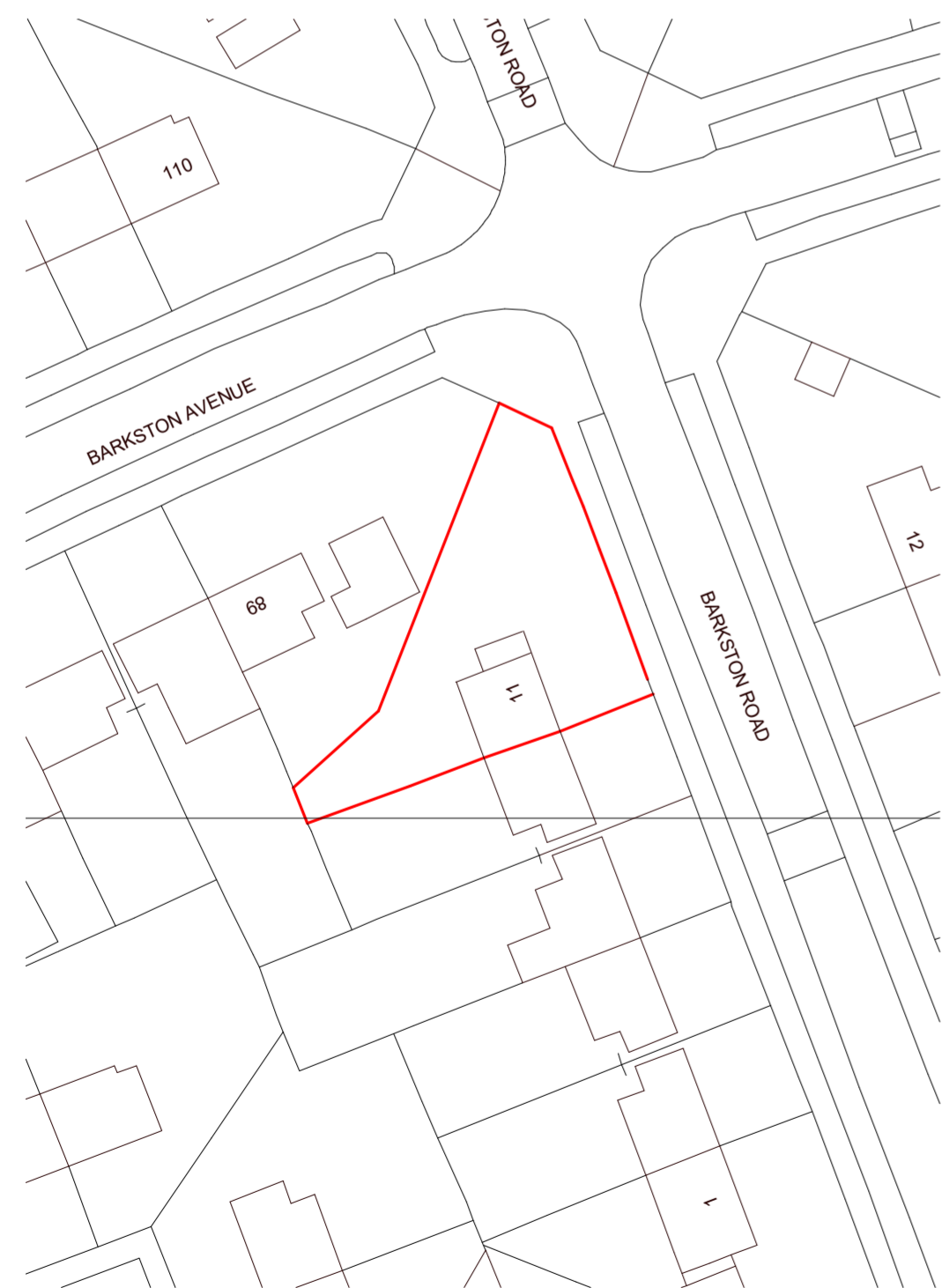
2 Site Plan Existing 1-500 1 : 500