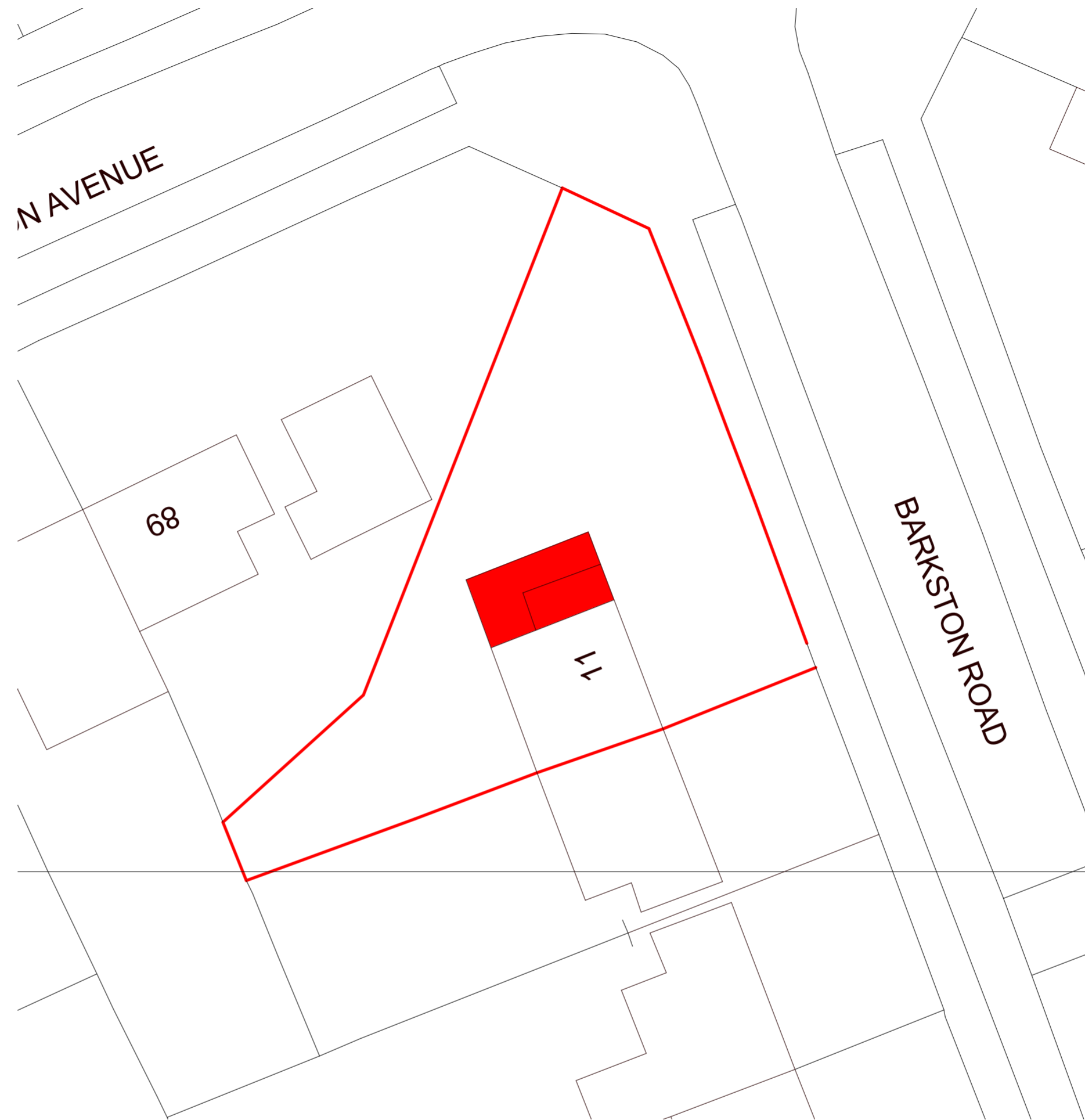
3 Site Plan Proposed 1-200 1 : 200