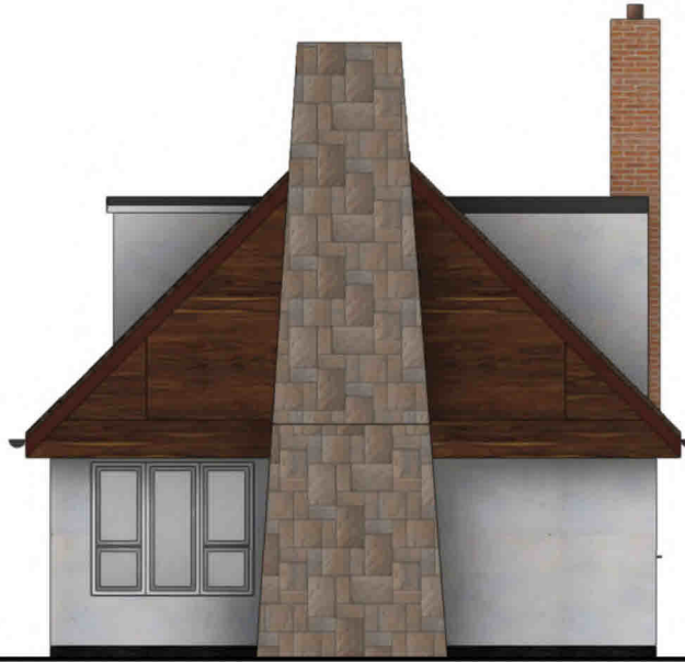
01 01 EXG ELEV SIDE Scale: 1:100