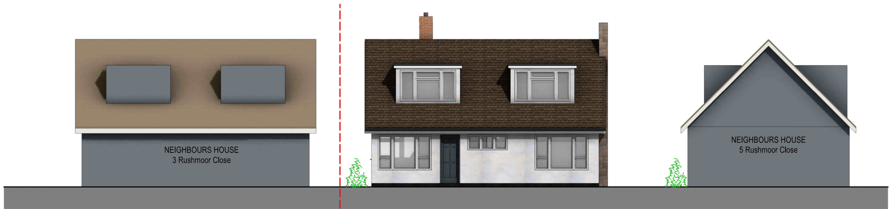
01 PROP ELEV FRONT Scale: 1:100