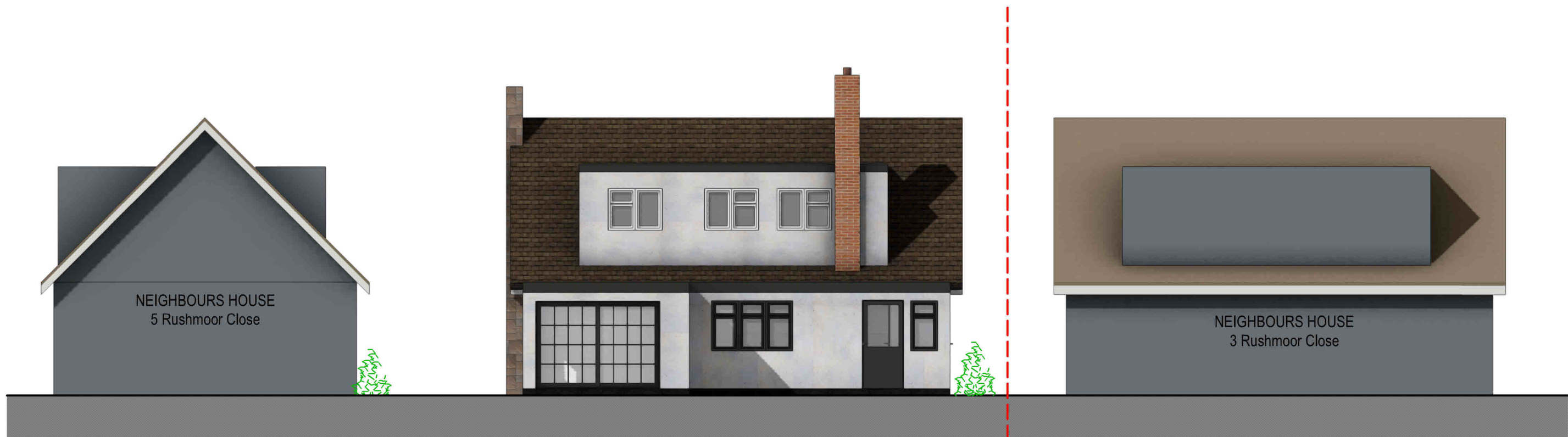
02 PROP ELEV REAR Scale: 1:100