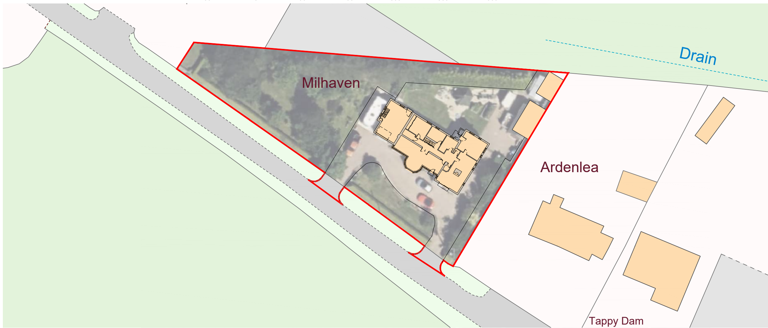
EXISTING SITE PLAN SCALE 1:500