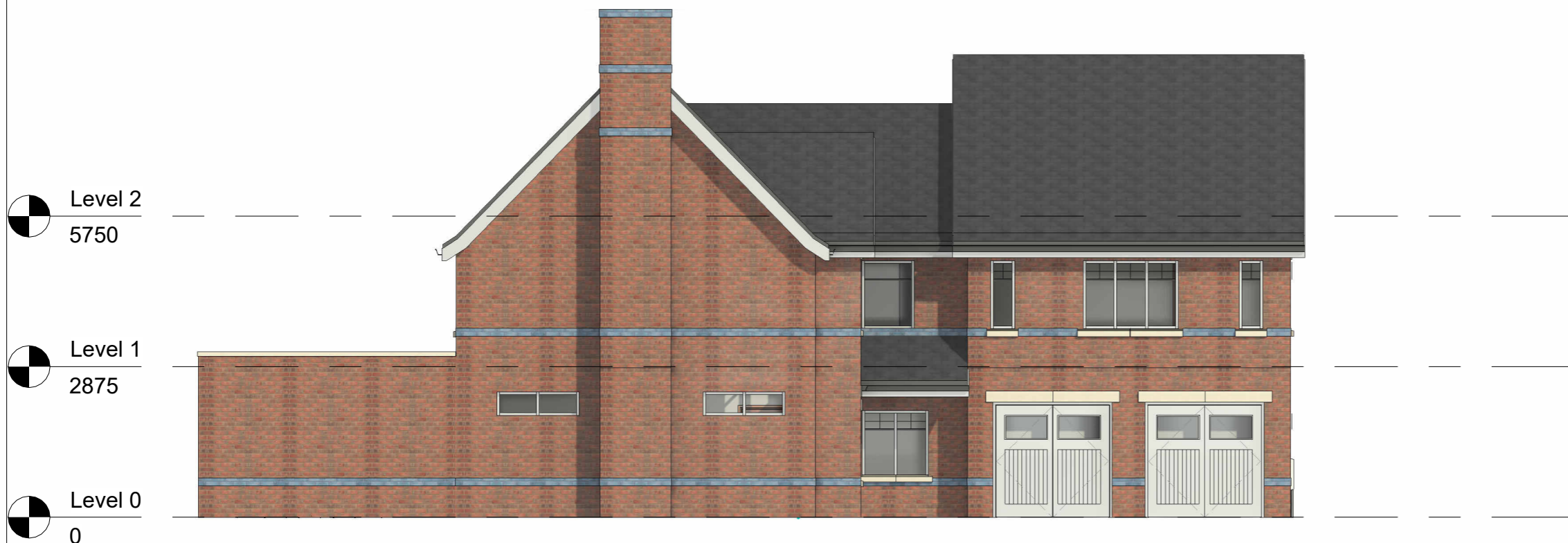
2 West 1 : 100