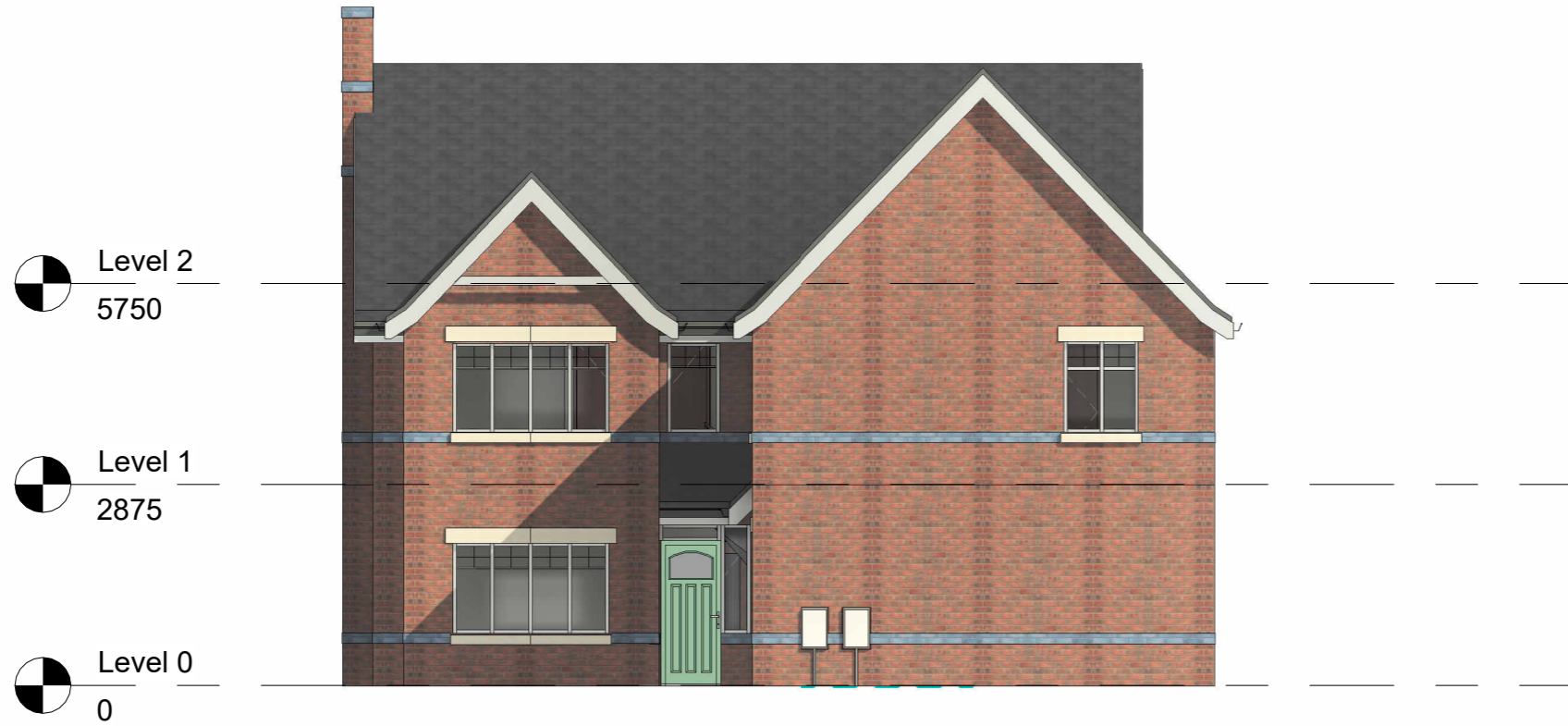
1 South 1 : 100