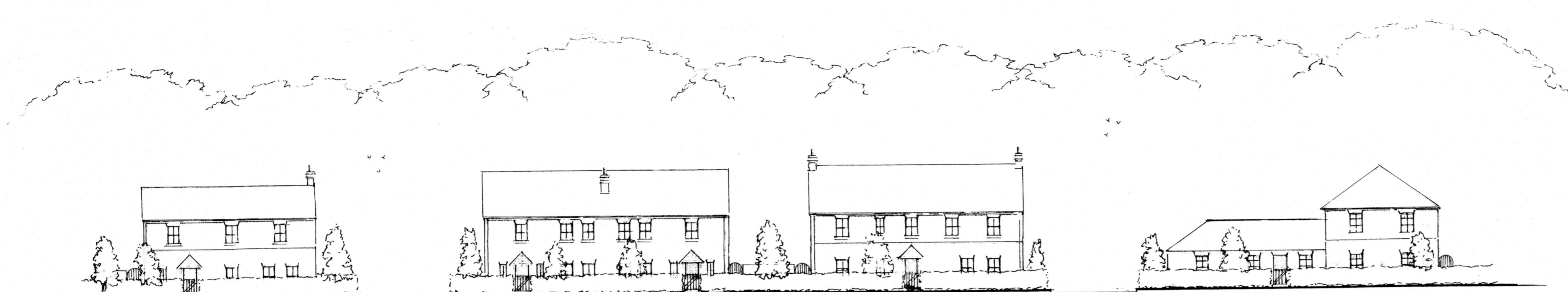
Street Scene Scale: 1:200