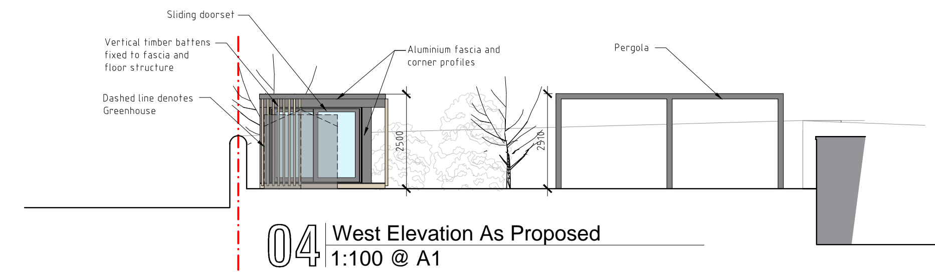
04 West Elevation As Proposed 1:100 @ A1