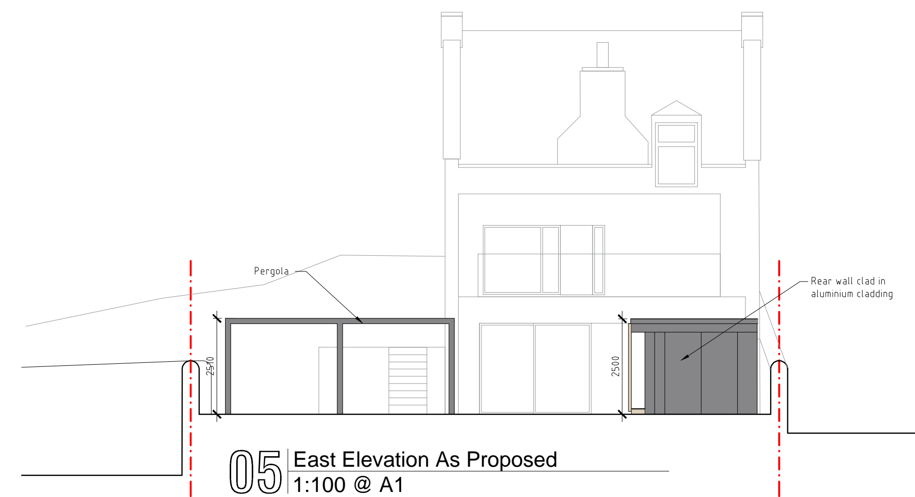
05 East Elevation As Proposed 1:100 @ A1

Do not scale this drawing. Use figured dimensions only. All dimensions given are in millimetres unless otherwise stated. All levels are in metres. All dimensions, levels shown on this drawing are to be verified by the contractor prior to the commencement of work. This drawing is to be read in conjunction with all relevant architectural, structural, services drawings and specifications. The copyright of this drawing and all relevant information appearing on this drawing is reserved by EKJN Architects. Use or disclosure to any third party either wholly or in part is prohibited unless expressly authorised by EKJN Architects. Variations and modifications to work shown on this drawing shall not be carried out without prior permission of EKJN Architects, who accept no liability for alterations made to this drawing by any other party.