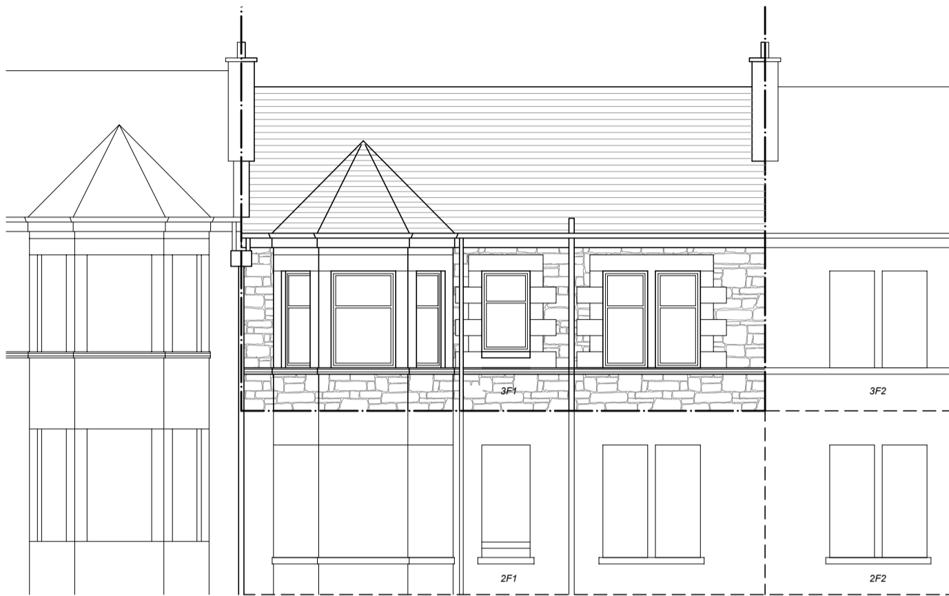
East Elevation (part) as Existing