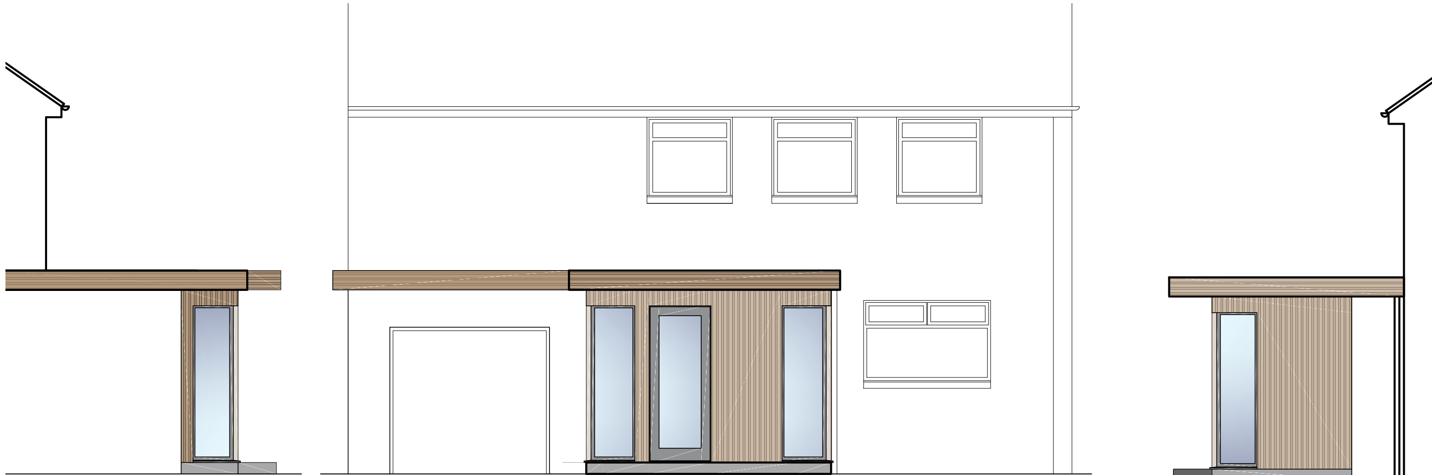
PROPOSED SIDE ELEVATION 1. SCALE 1:50.