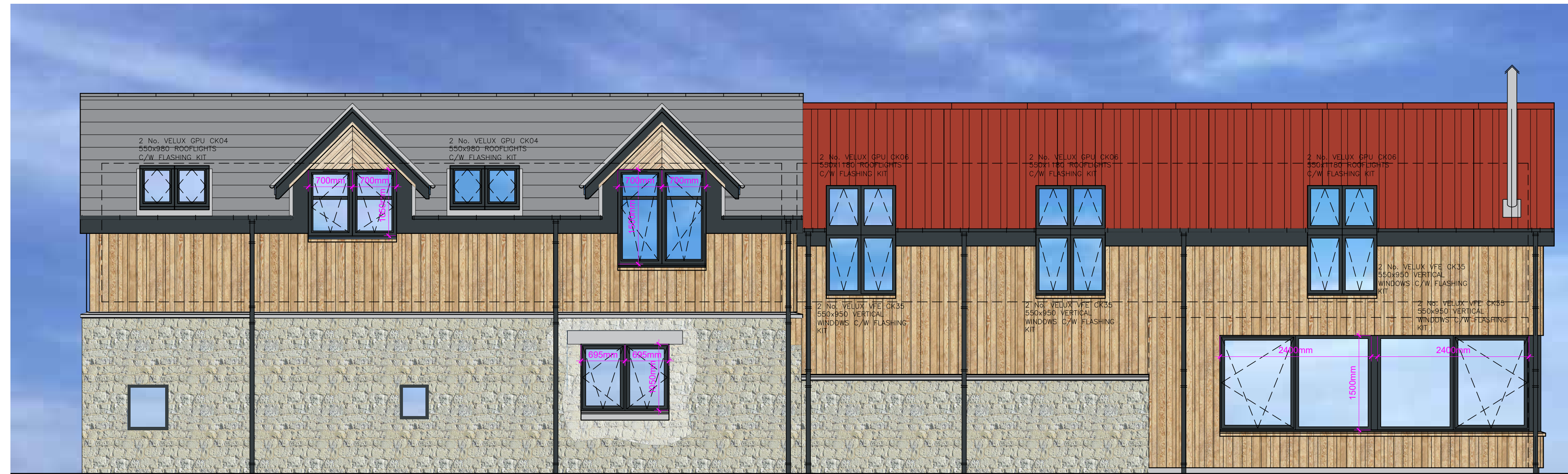
WEST FACING ELEVATION