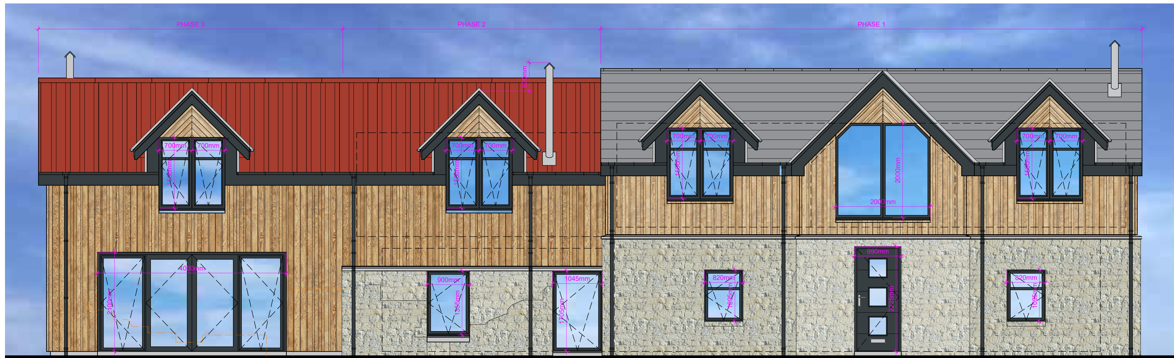
EAST FACING ELEVATION