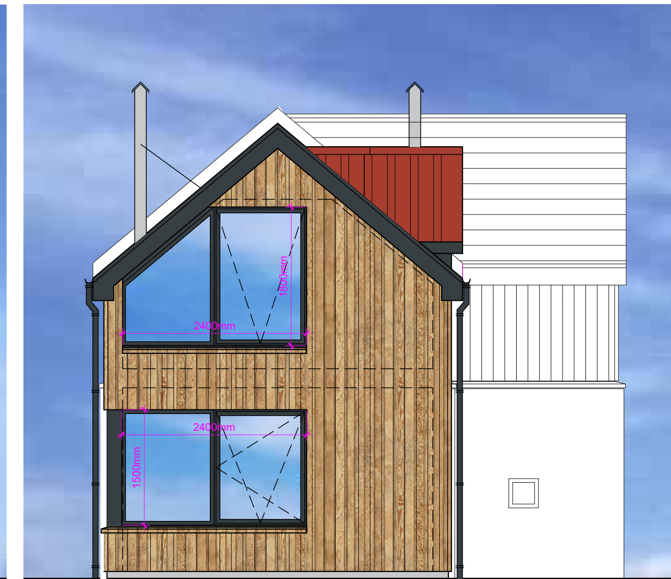
SOUTH FACING ELEVATION