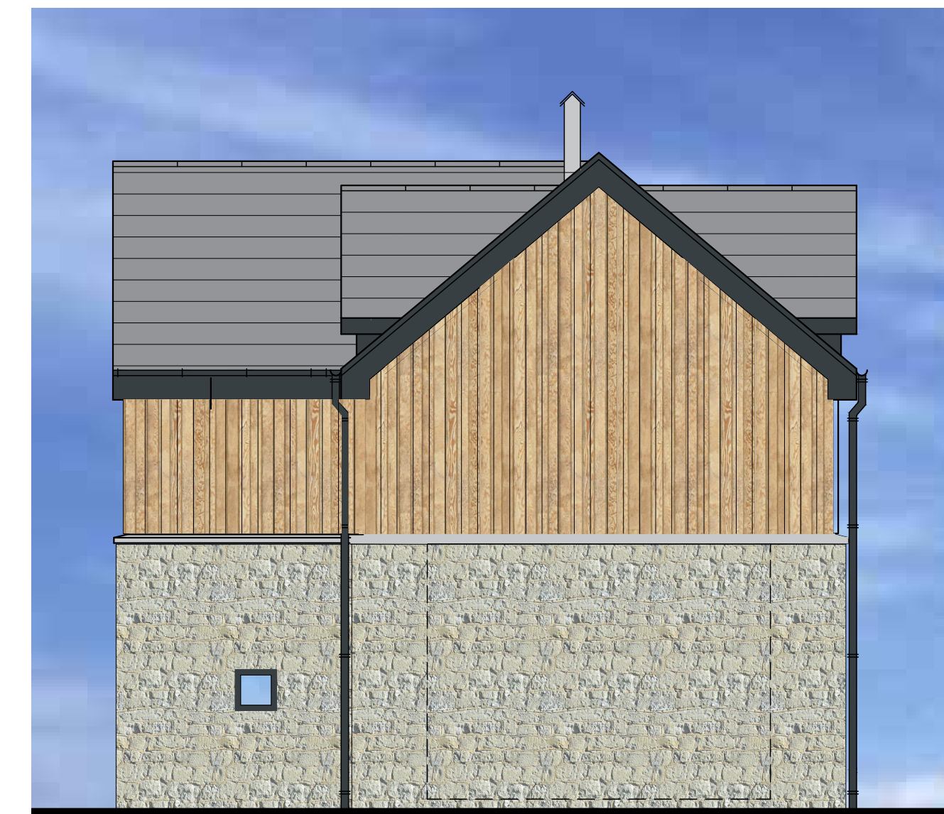
NORTH FACING ELEVATION