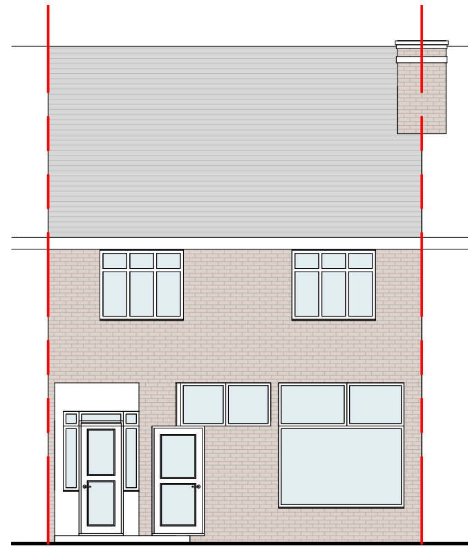
Proposed Front Elevation 1 : 100