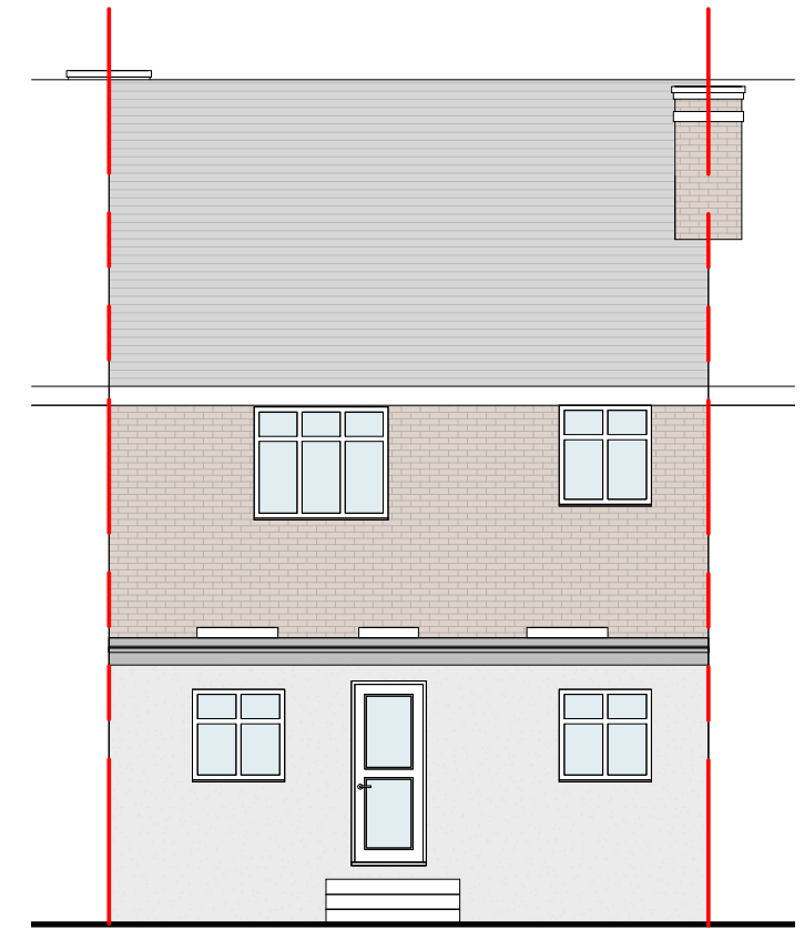
Proposed Rear Elevation 1 : 100