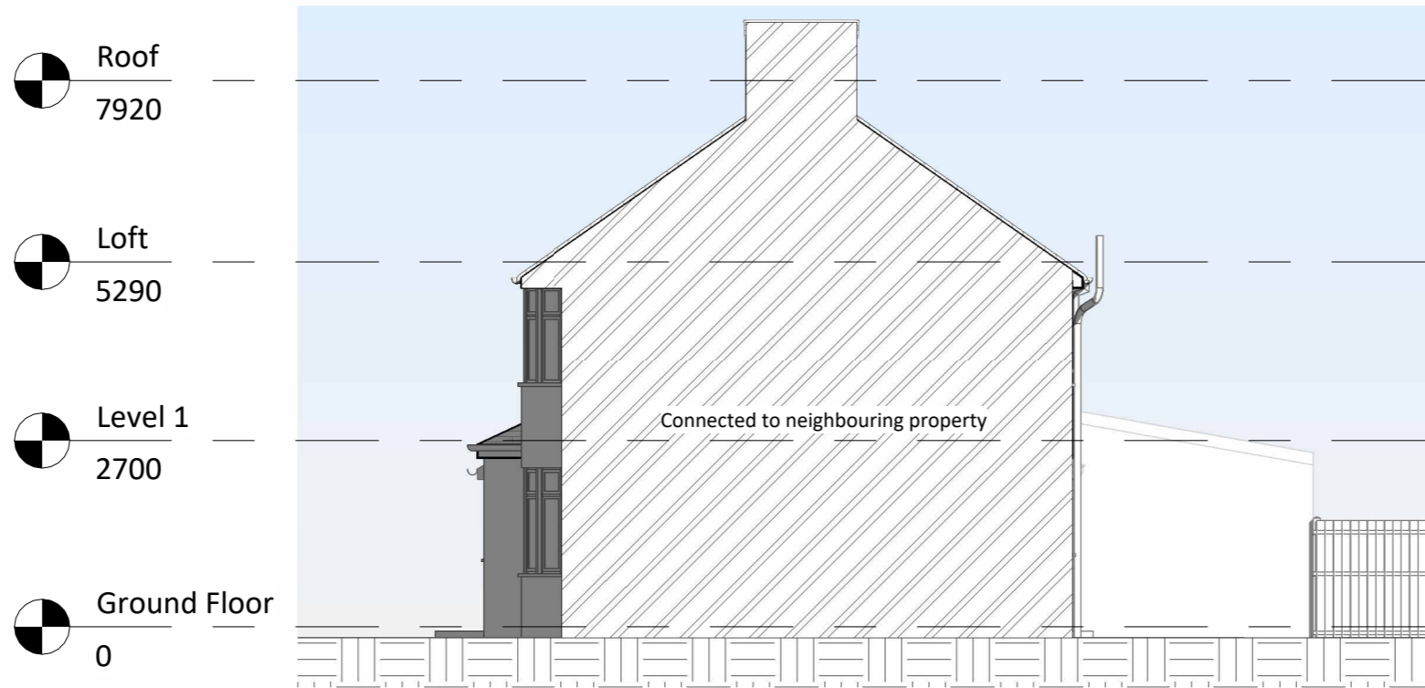
1 Proposed Right Elevation 1 : 100