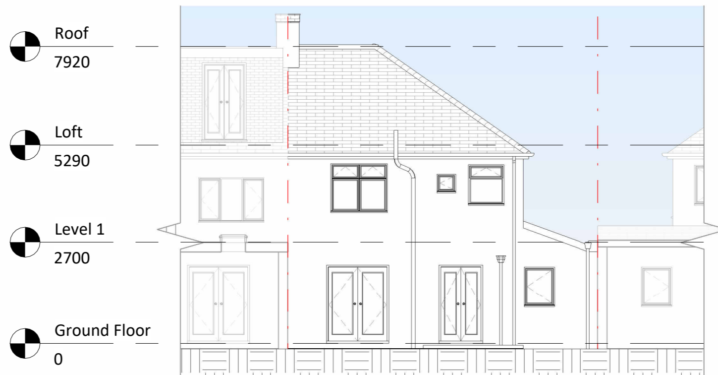
2 Existing Rear Elevation 1 : 100