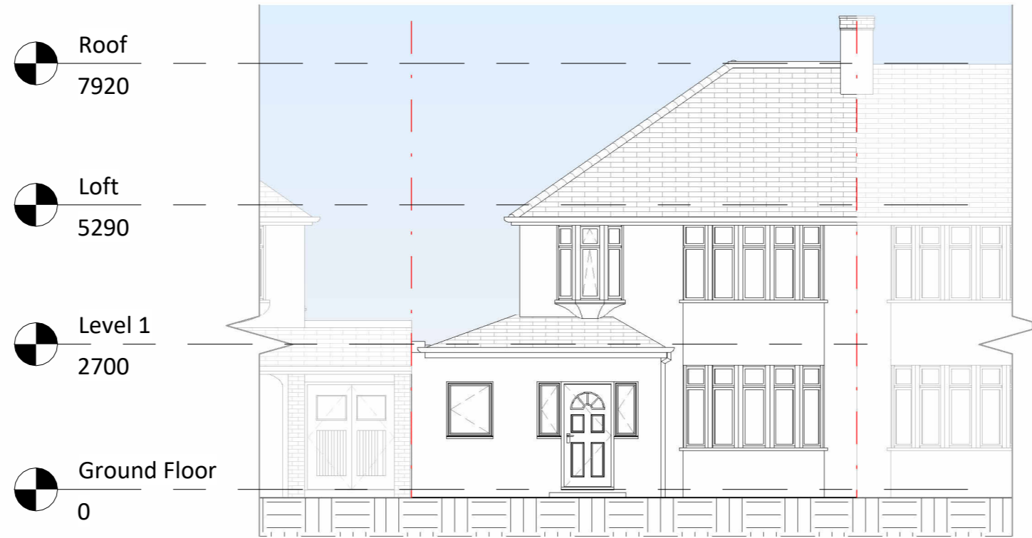
1 Existing Front Elevation 1 : 100