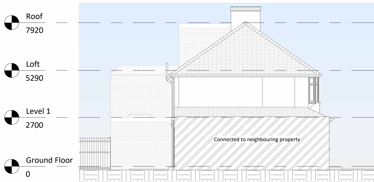
2 Existing Left Elevation 1 : 100