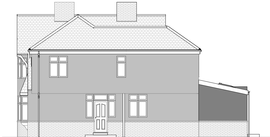
PROPOSED ELEVATION B