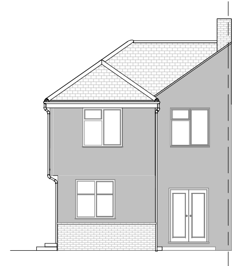
EXISTING ELEVATION C