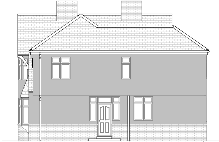
EXISTING ELEVATION B