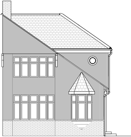
EXISTING ELEVATION A (NO CHANGES)