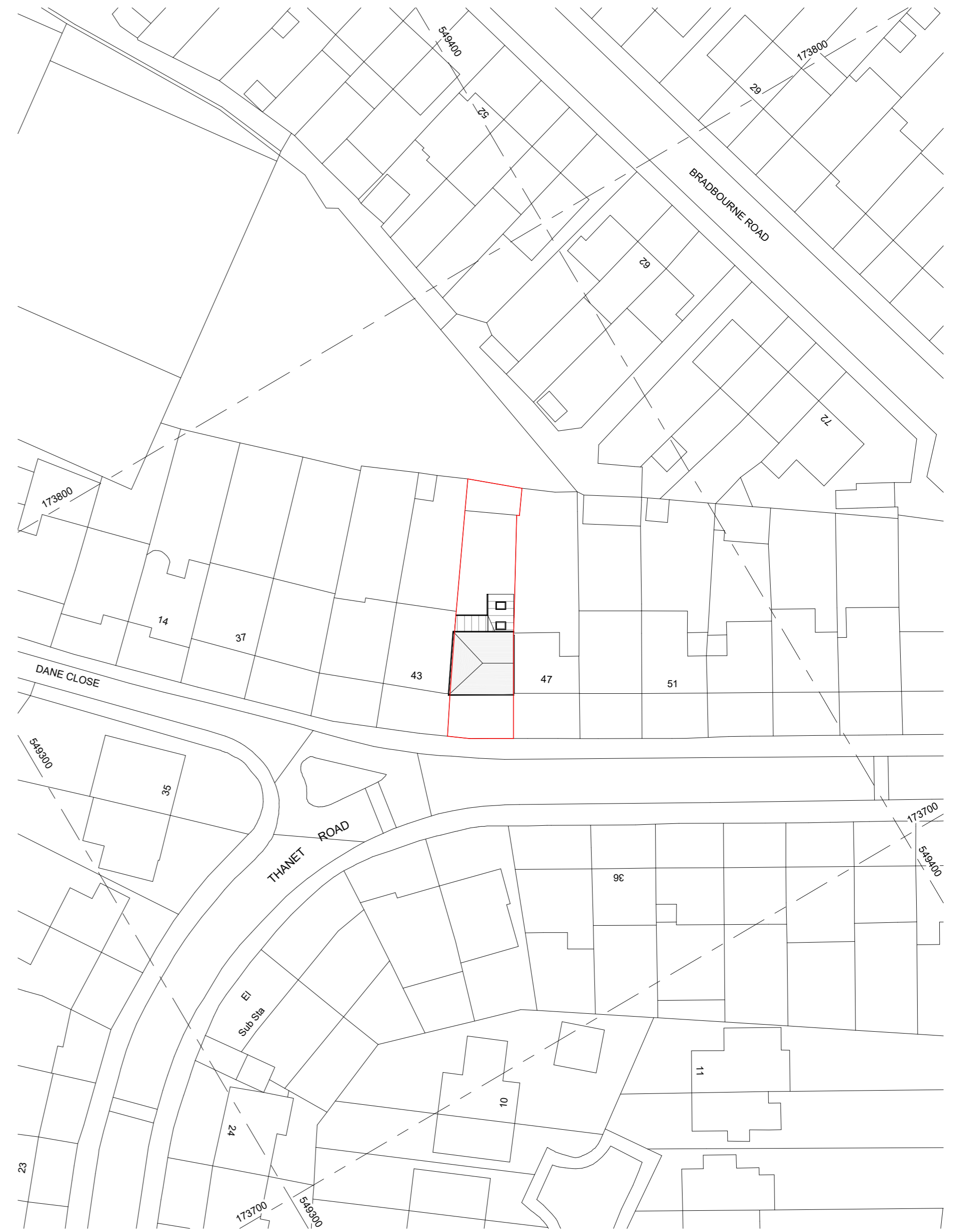
BLOCK PLAN - PROPOSED 1 1:500