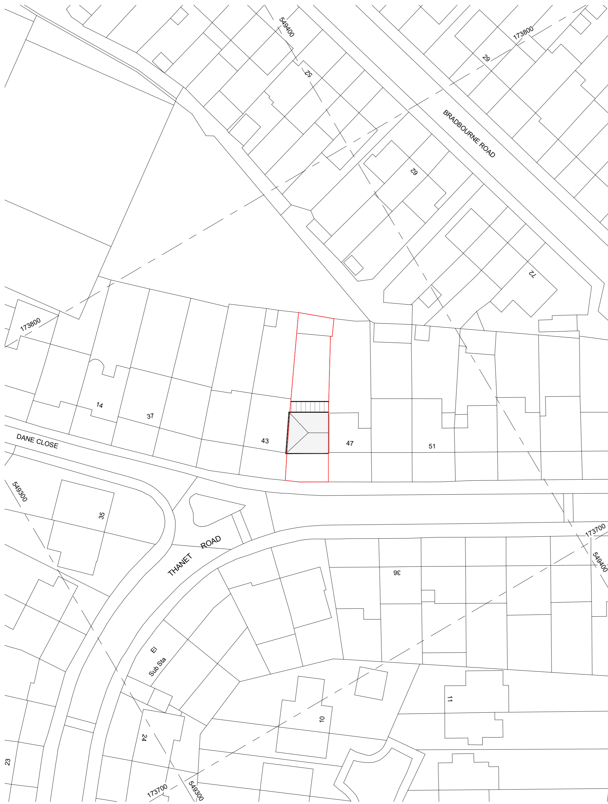
BLOCK PLAN - EXISTING 7 1:500