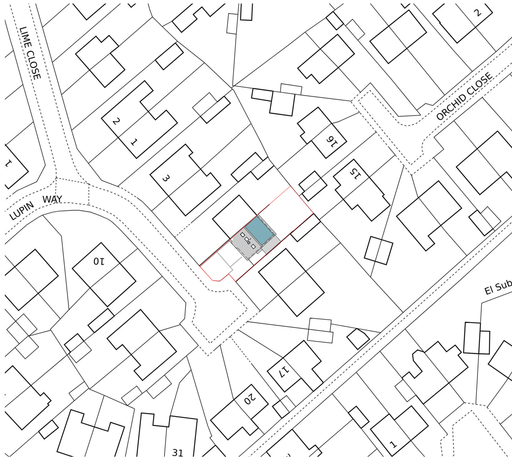
Proposed Block Plan

Any dimensions shown should be checked on site and discrepancies reported to the Architect prior to construction. Designs are not coordinated with engineer projects. Do not scale for construction purposes.