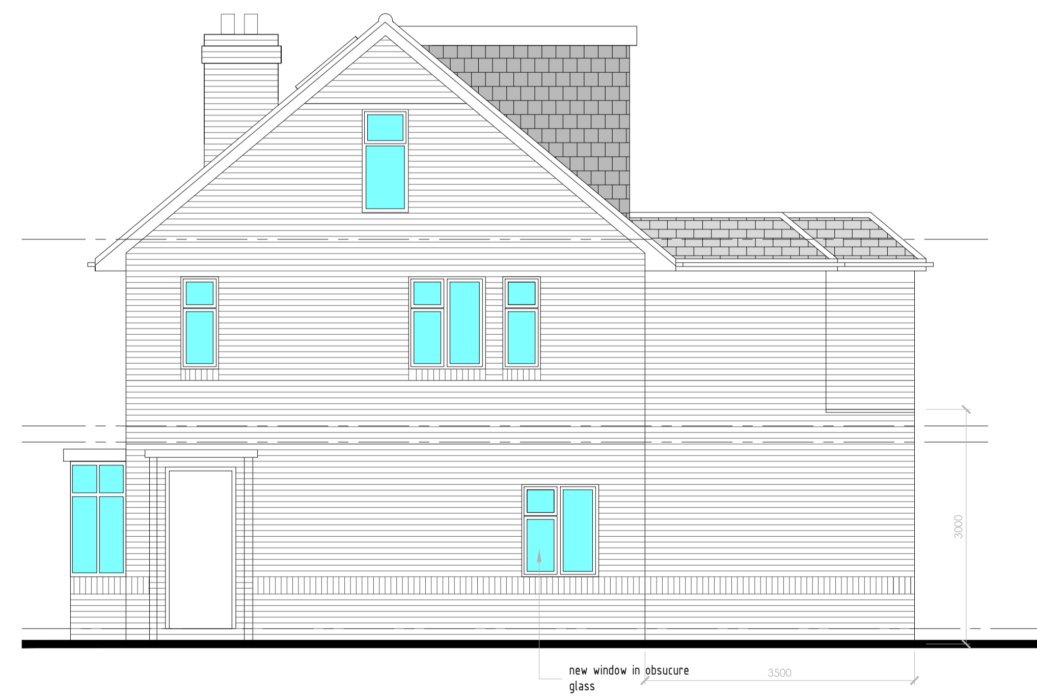
SIDE ELEVATION AS PROPOSED LOOKING FROM No. 10