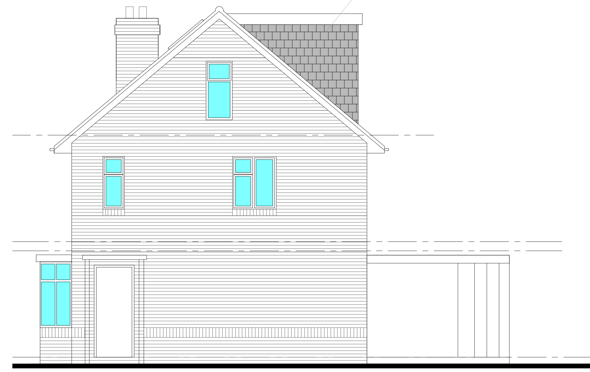
SIDE ELEVATION AS EXISTING LOOKING FROM No. 10

loft conversion and works carried out under the approved Certificate of Lawful Development dated 15th September 2022 under planning ref: 22/01011/LDC