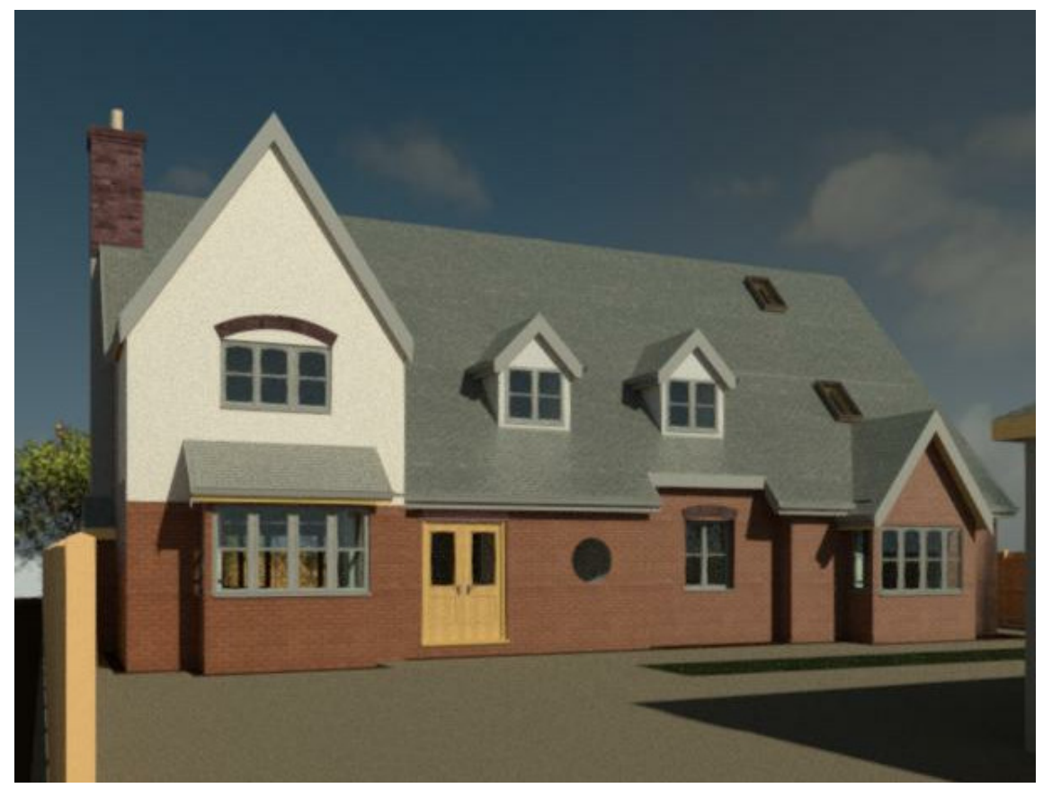
2 3D View 1_3 1:1