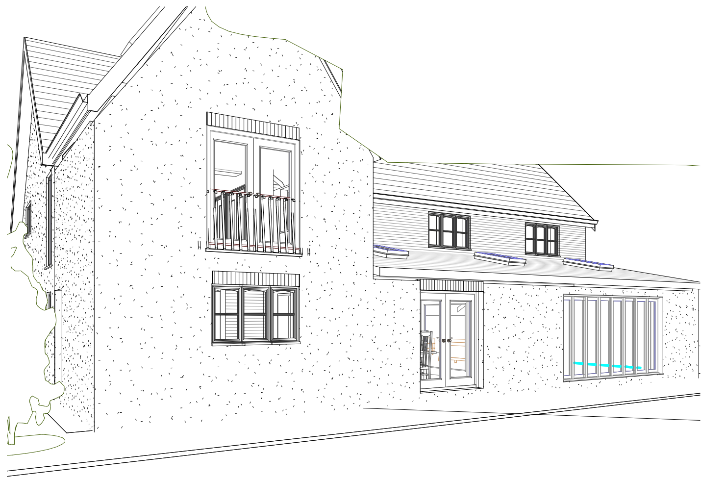
2 3D View 2

The contractor is responsible for checking dimensions, tolerances and references Any discrepancy to be verified with the Architect before proceeding with the works. Where an item is covered by drawings to different scales the larger scale drawing is to be worked to Do not scale drawing. Figured dimensions to be worked to in all cases