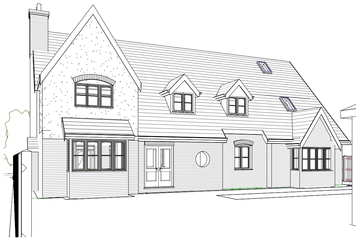
1 3D View 1