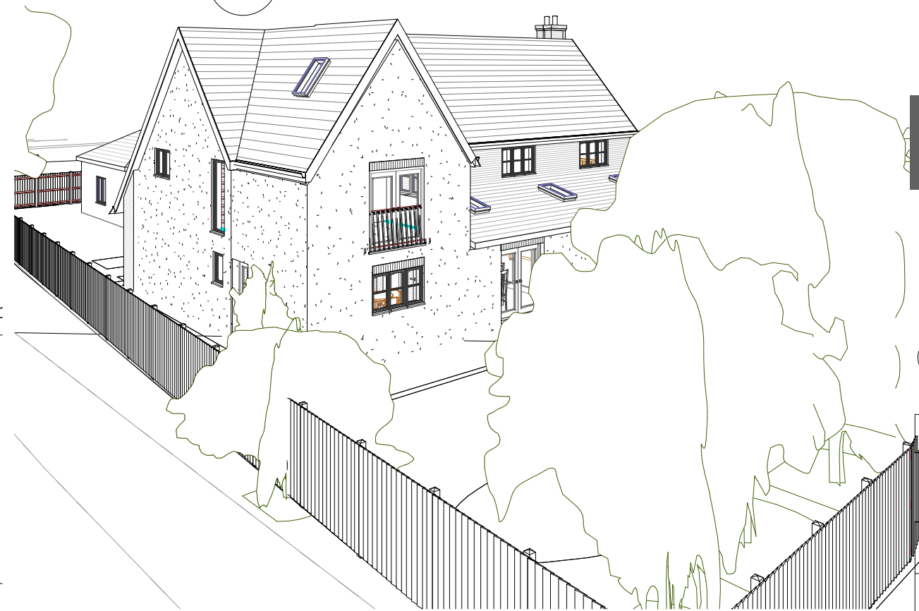
3 3D View 5