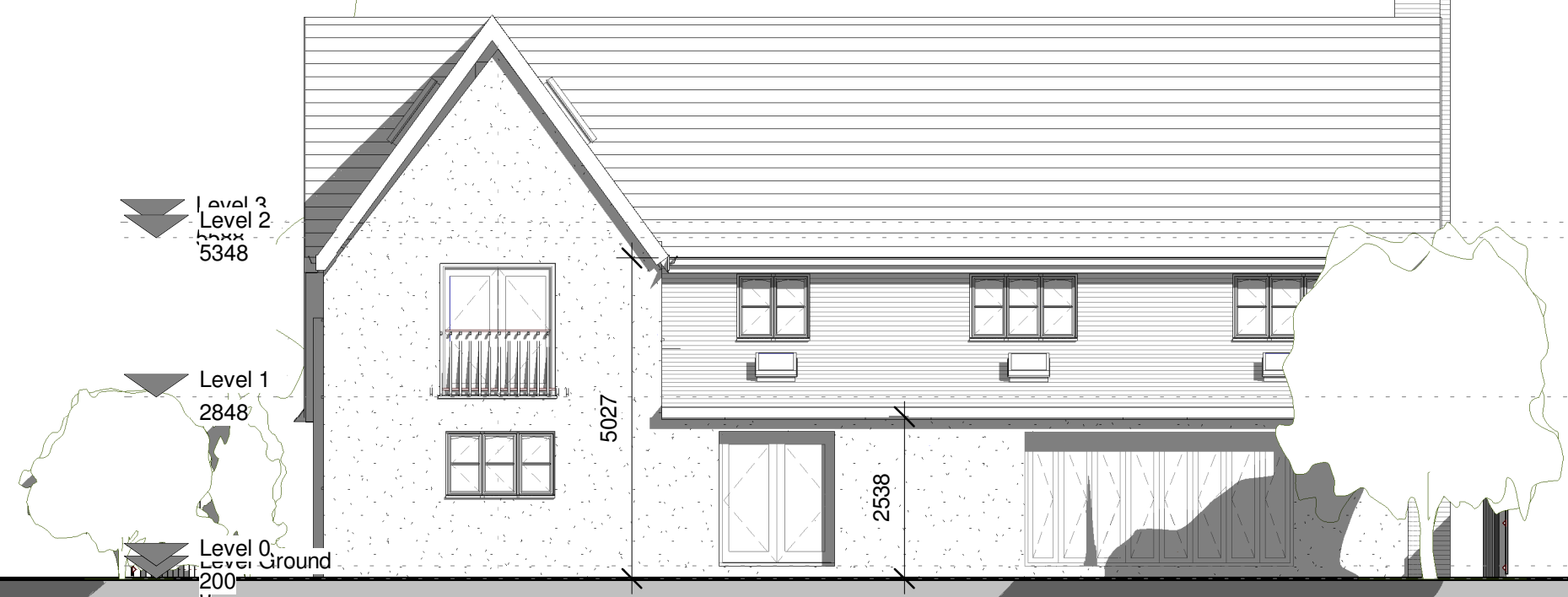
2 South 1 : 100