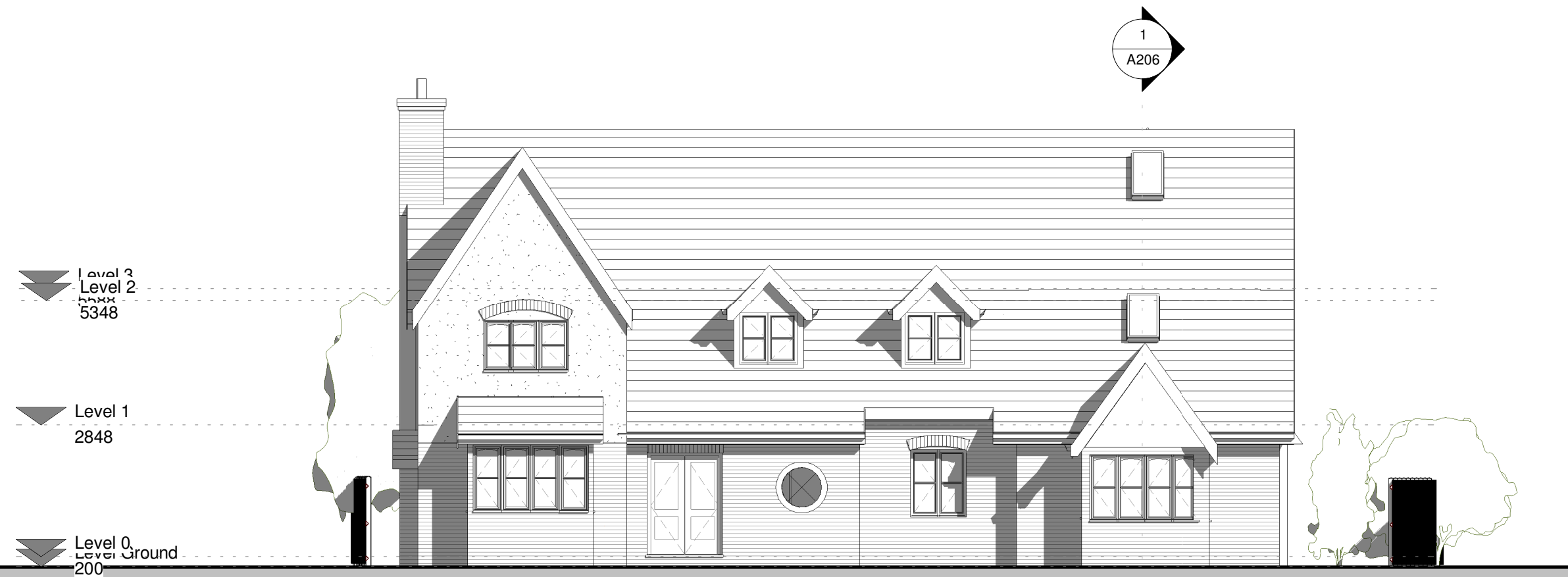
1 North 1 : 100

The contractor is responsible for checking dimensions, tolerances and references Any discrepancy to be verified with the Architect before proceeding with the works. Where an item is covered by drawings to different scales the larger scale drawing is to be worked to Do not scale drawing. Figured dimensions to be worked to in all cases