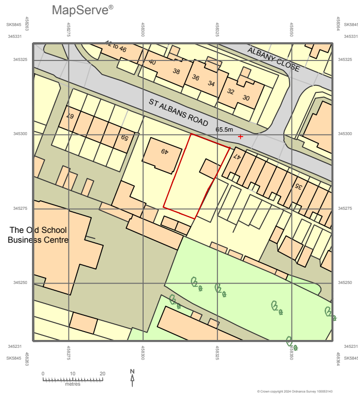
01 | O.S Site Location Plan 1:1250 @ A3