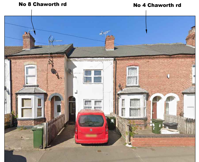
STREET VIEW NTS