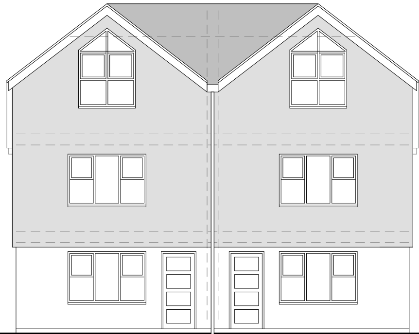
PROPOSED Front - North Elevation