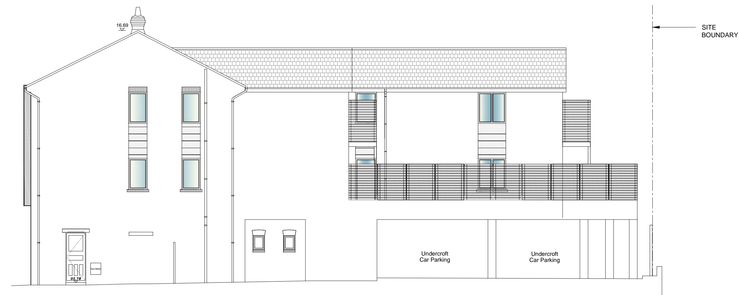
Side Elevation 2