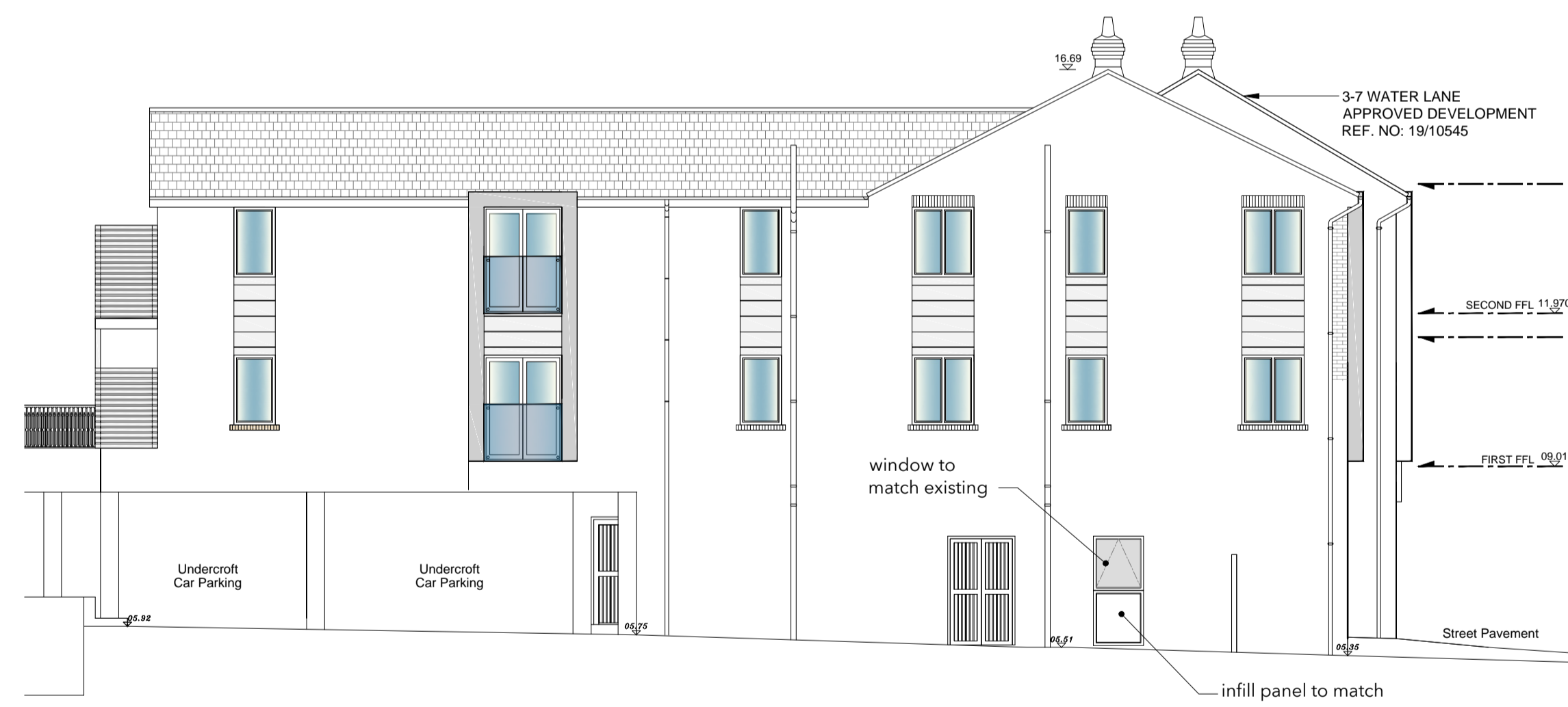
Side Elevation 1