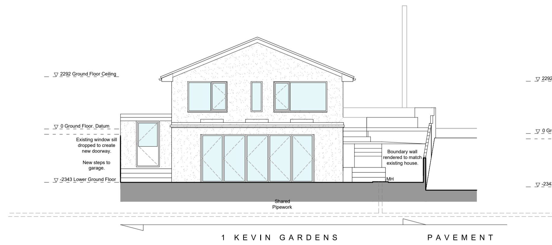
03 Rear Elevation - West Scale: 1:100