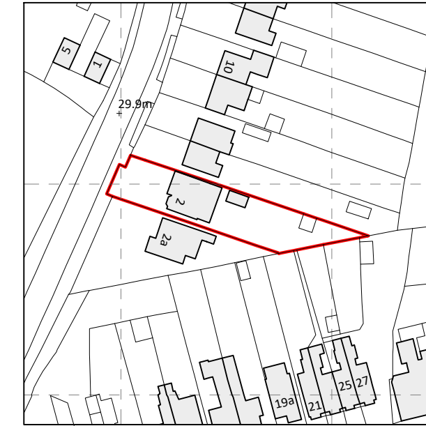
LOCATION PLAN AS PROPOSED Scale 1:1250