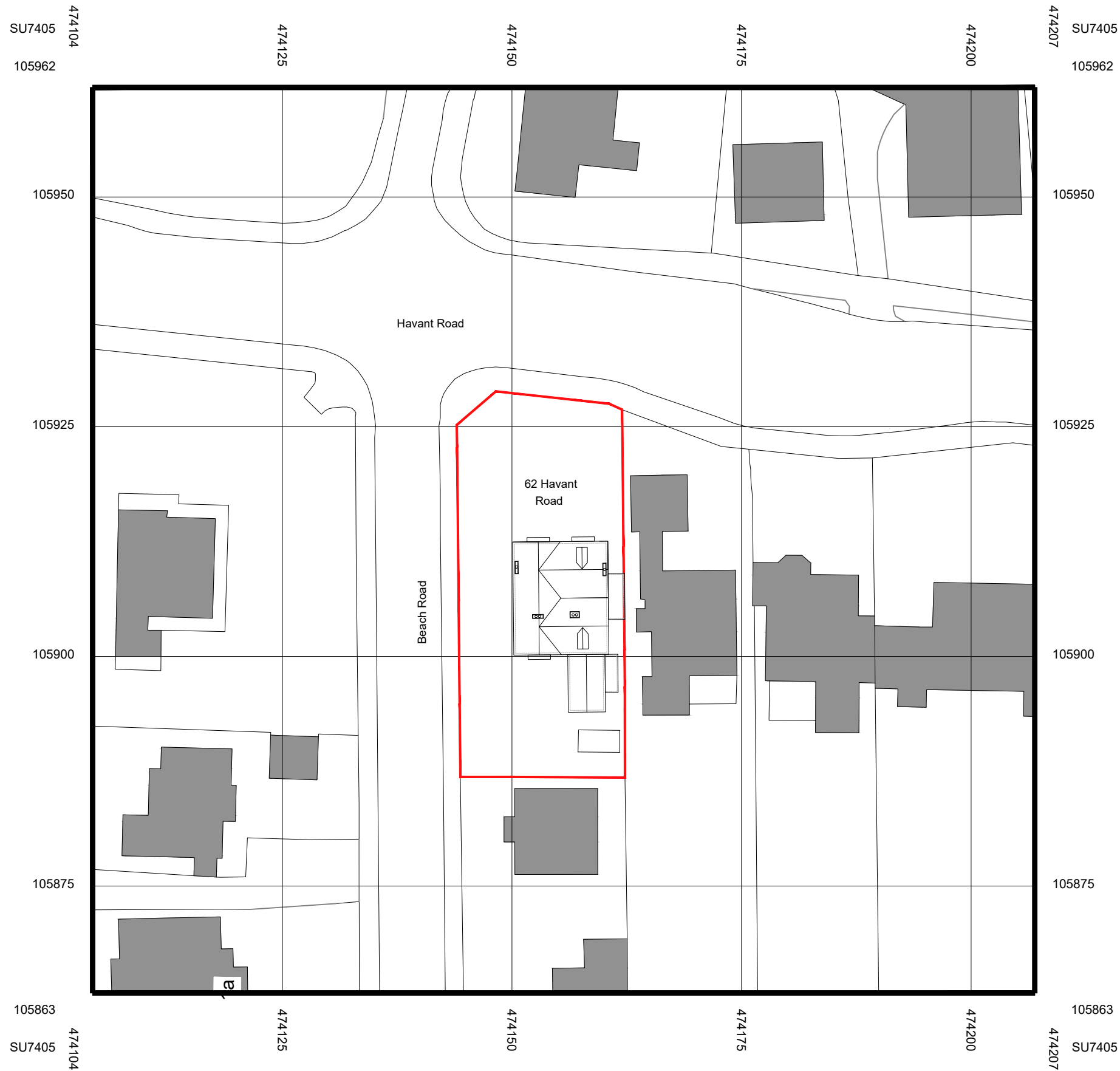
Existing Site plan 1:500