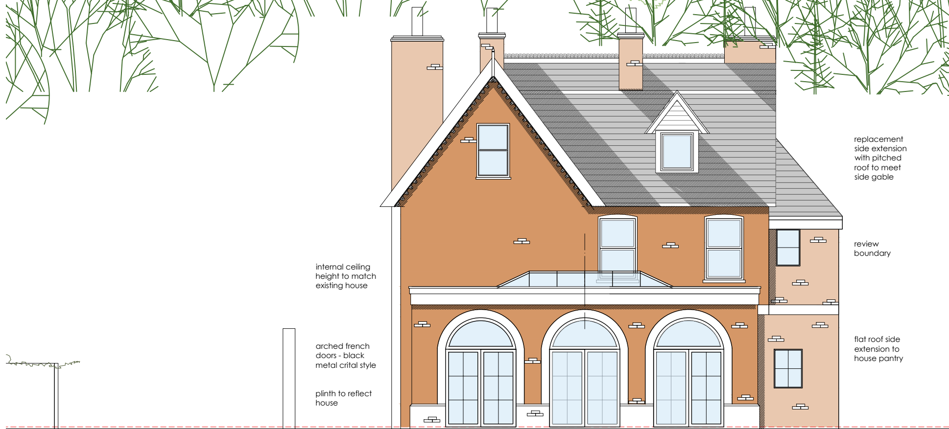
04 - Proposed rear elevation @ 1:100