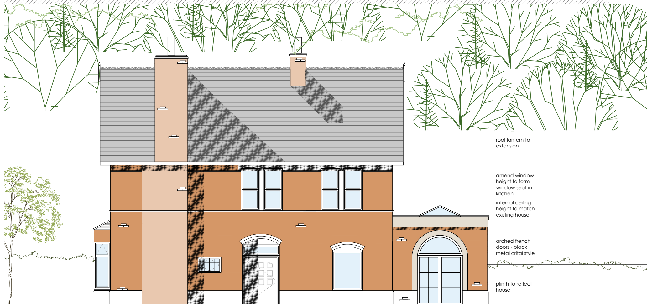
03 - Proposed side elevation @ 1:100