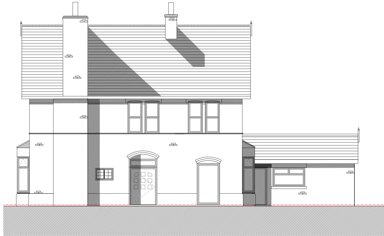
Existing side elevation 03 1:100