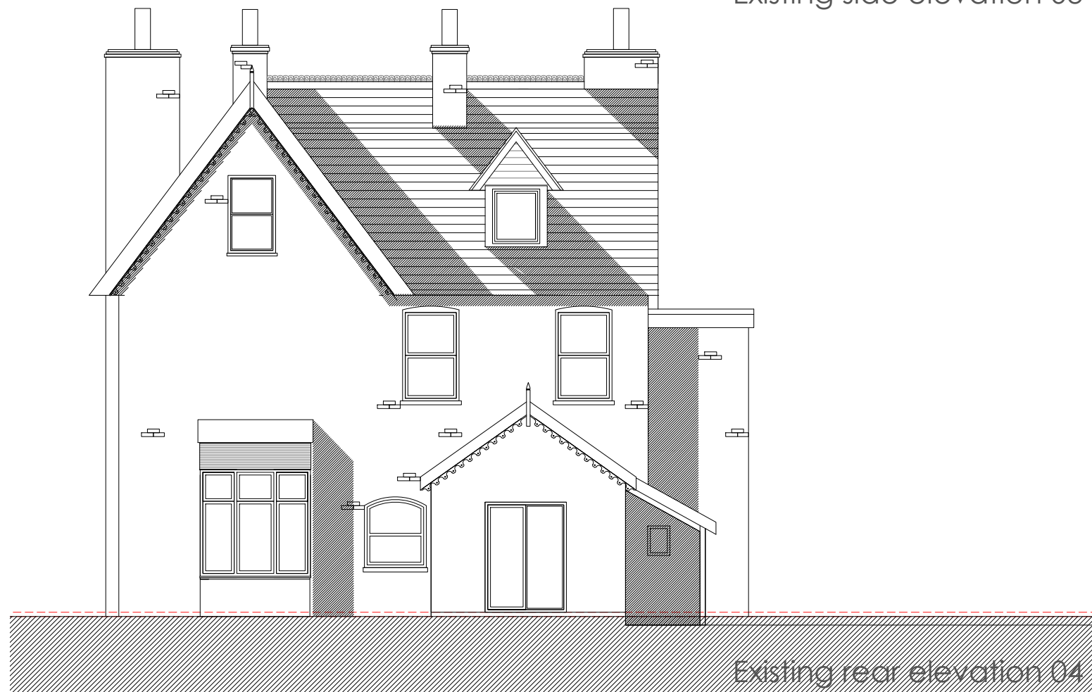
Existing rear elevation 04 1:100