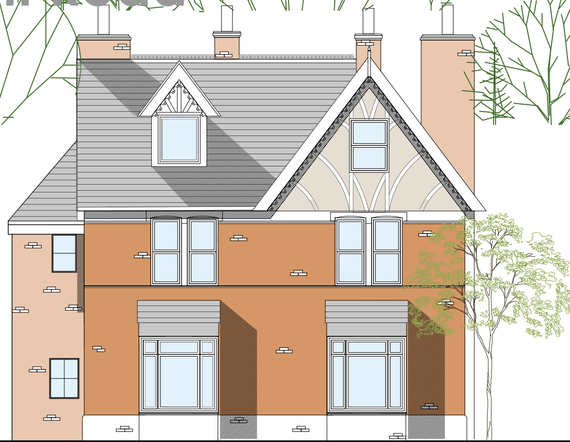
02 - Proposed Front elevation @ 1:100