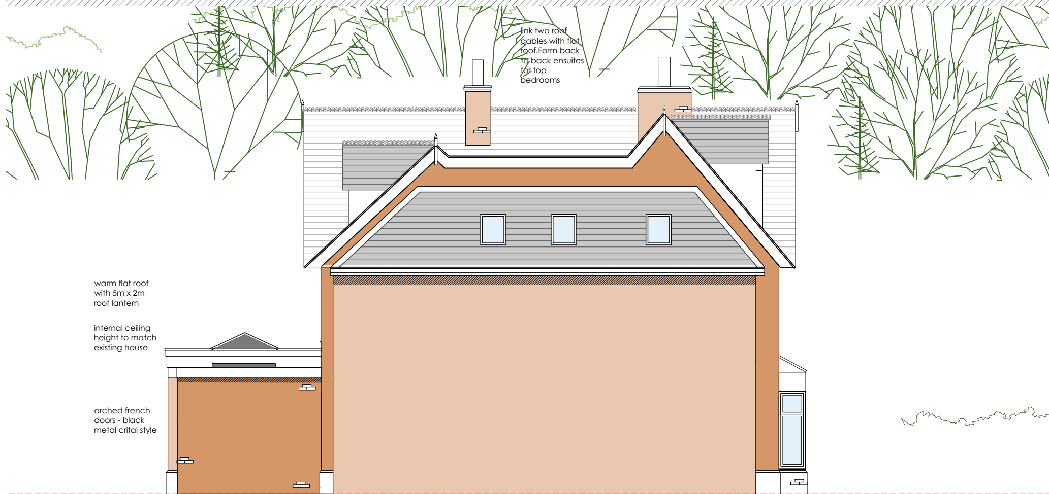
01 - Proposed side elevation @ 1:100