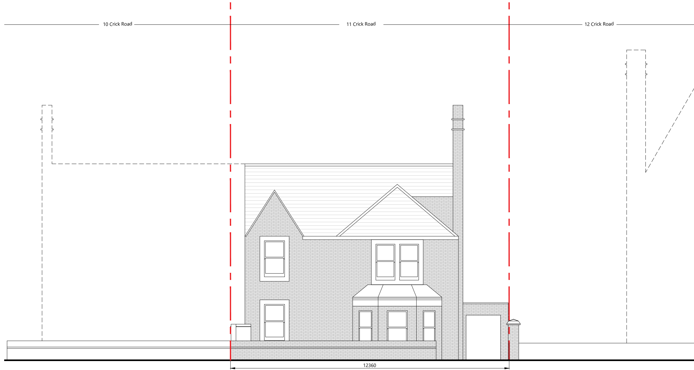
1 Existing Front Elevation Scale 1:100