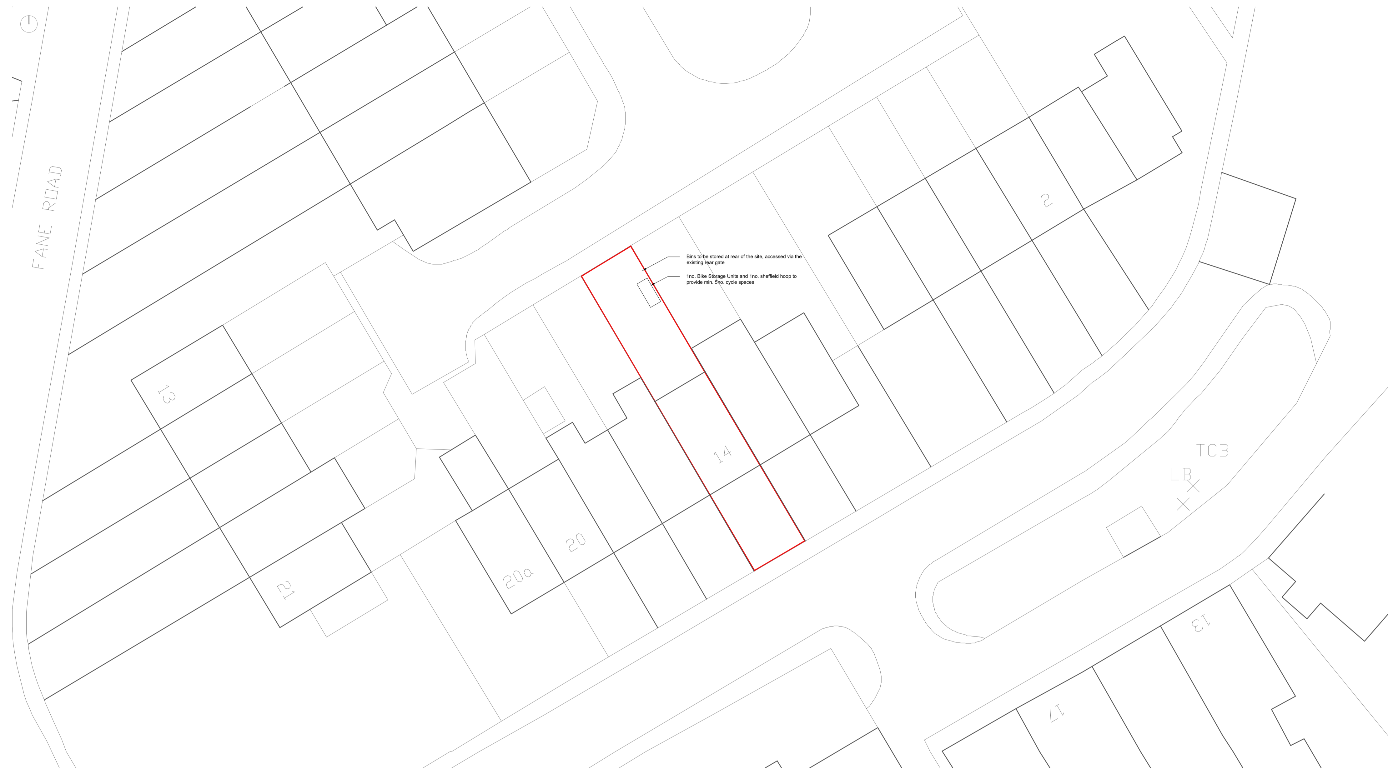
BLOCK PLAN SCALE 1:200

Drawing based on survey information by others and subject to planning, building regulation and other statutory approvals. Ordnance Survey, (c) Crown Copyright 2024. All rights reserved. Licence number 100022432