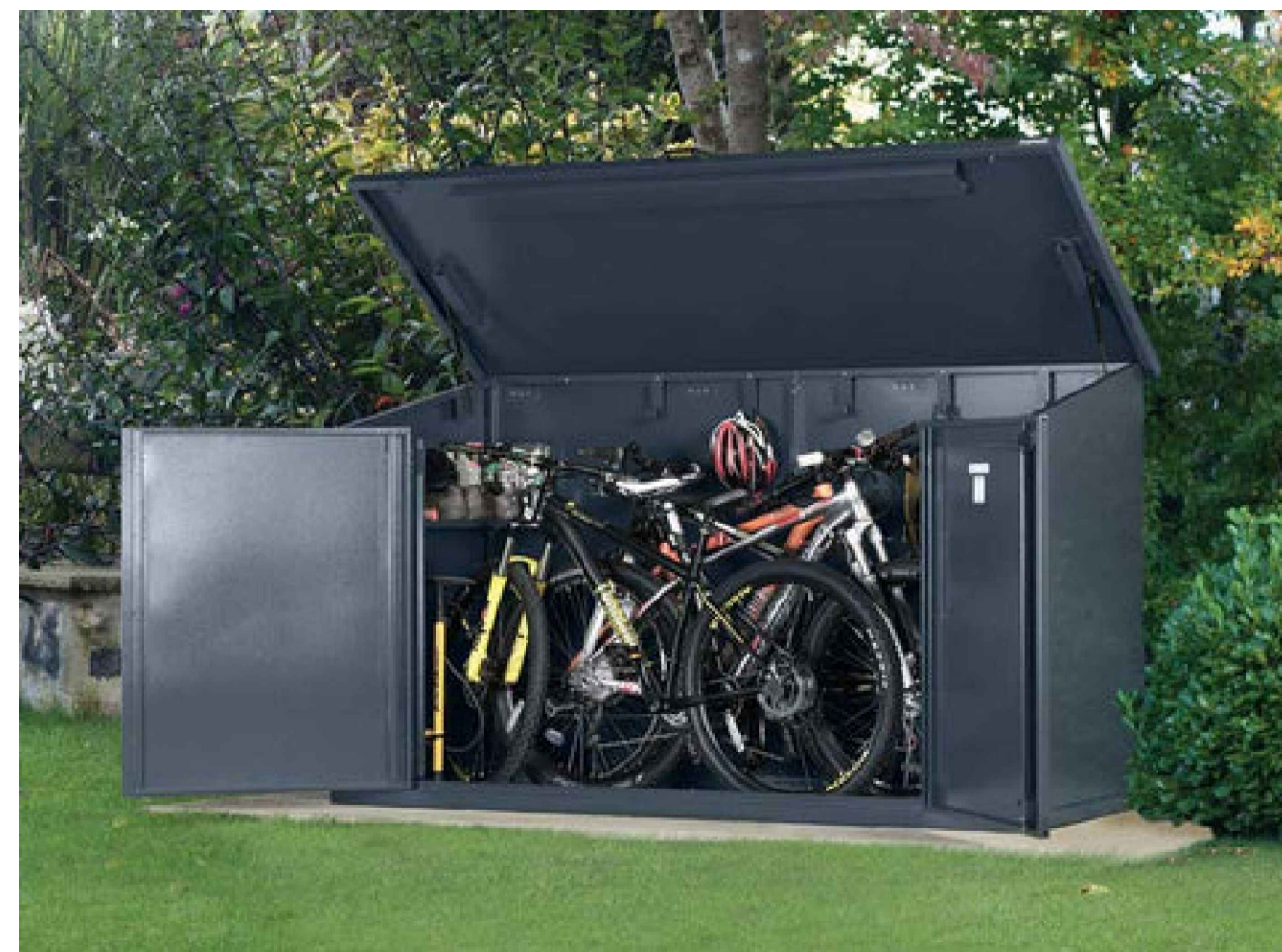
PROPOSED BIKE STORAGE UNIT SCALE - N/A

* Please note, this product needs approx 100mm clearance at the back (from a wall/fence) as the top sticks/swings out a little when the lid is lifted.