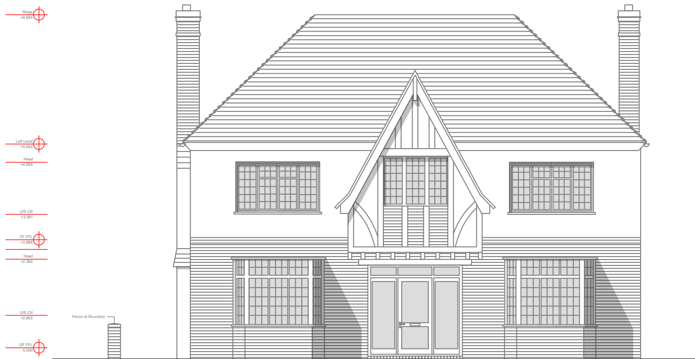
South-East Elevation Scale 1/100