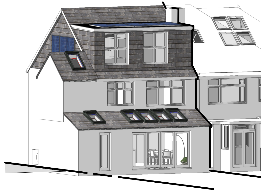
2 3D View Rear

Notes: Do not scale off this drawing. Drawings to be read in conjunction with Structural Engineer's drawings and Architect's specification. For all structural information refer to structural engineer's drawings. All dimensions and levels to be checked on site and any discrepancies reported immediately to the Architect. Copyright relating to all drawn information resides with the Architect.