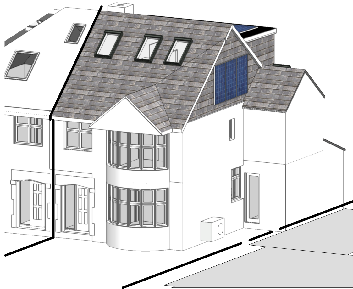
1 3D View Front