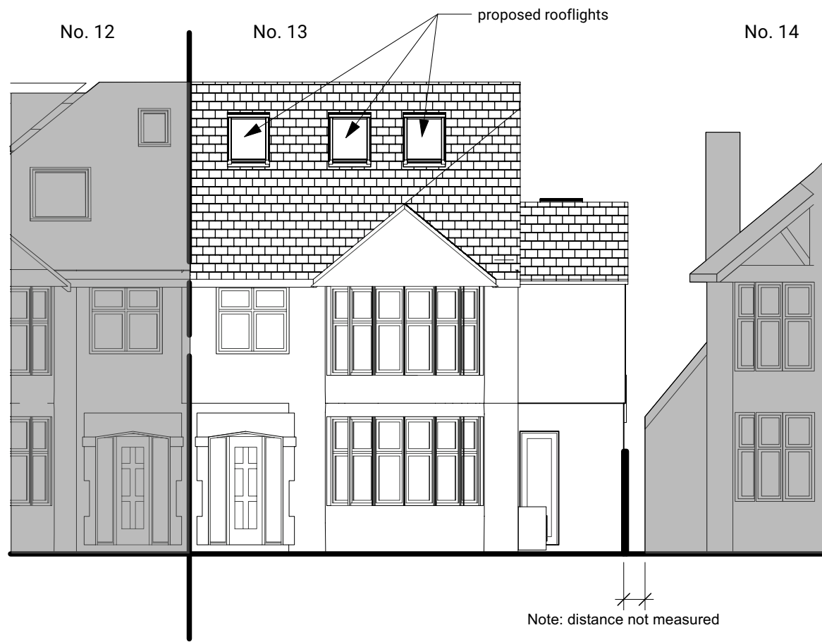
1 Front Elevation (West) Scale: 1:100