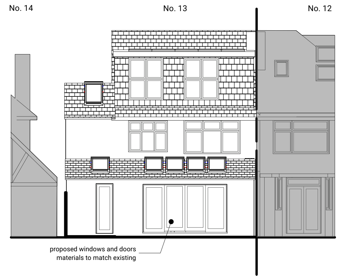
2 Rear Elevation (East) Scale: 1:100