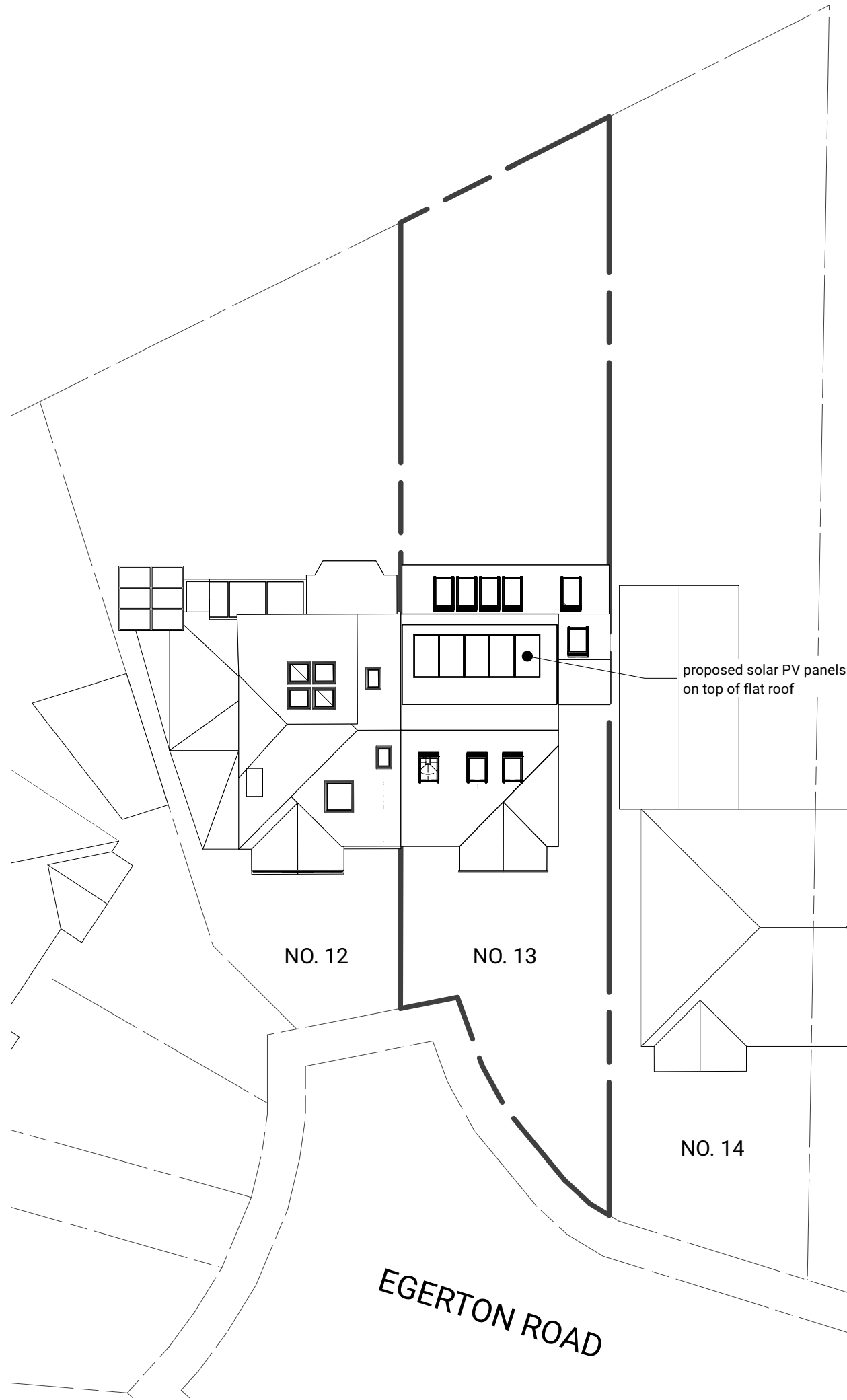
1 Site Plan Scale: 1:200