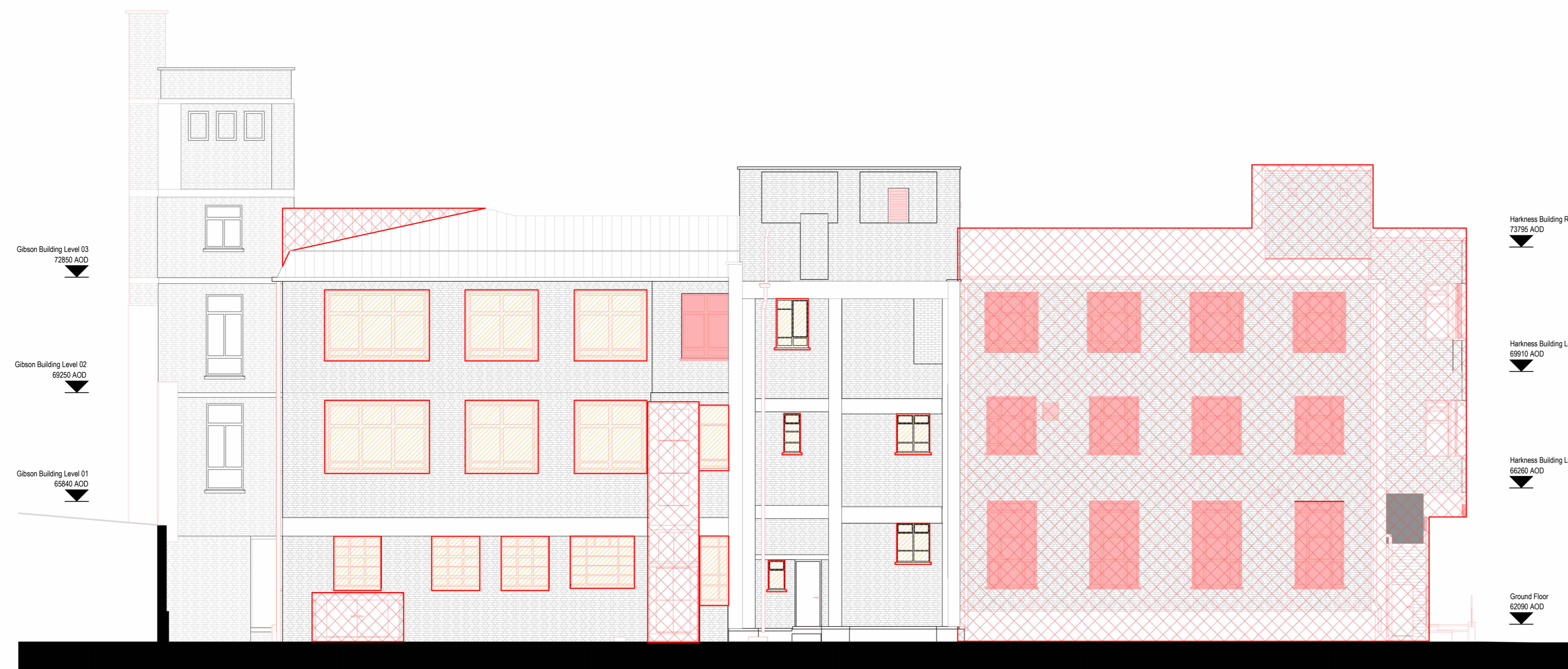
2 Demolition - Elevation - West 1 : 100