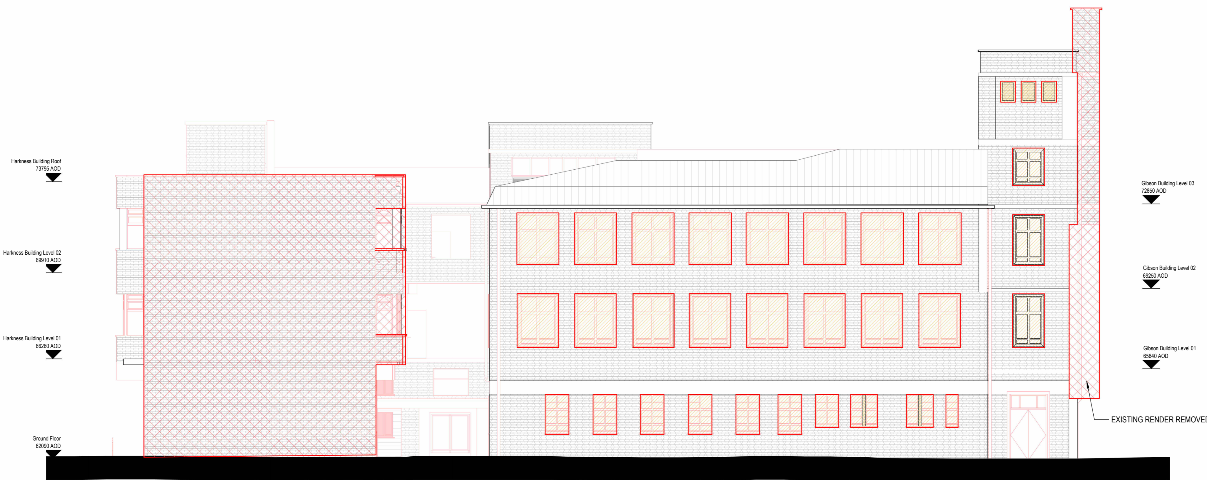
1 Demolition - Elevation - East 1 : 100