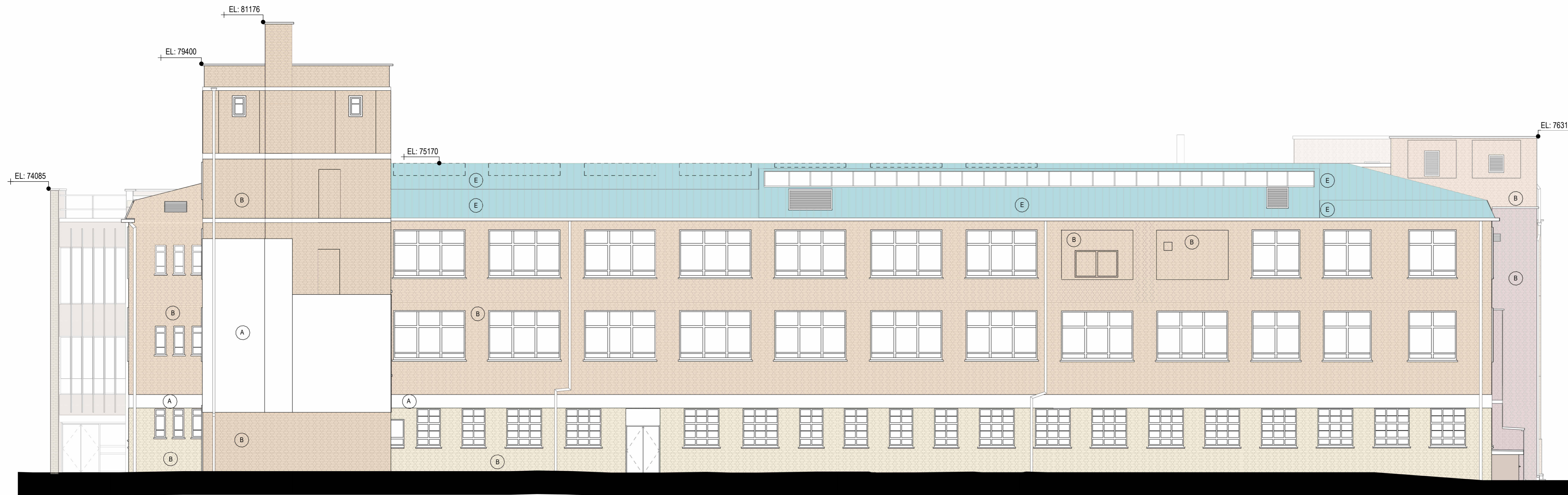
1 Existing Elevation - North 1:100