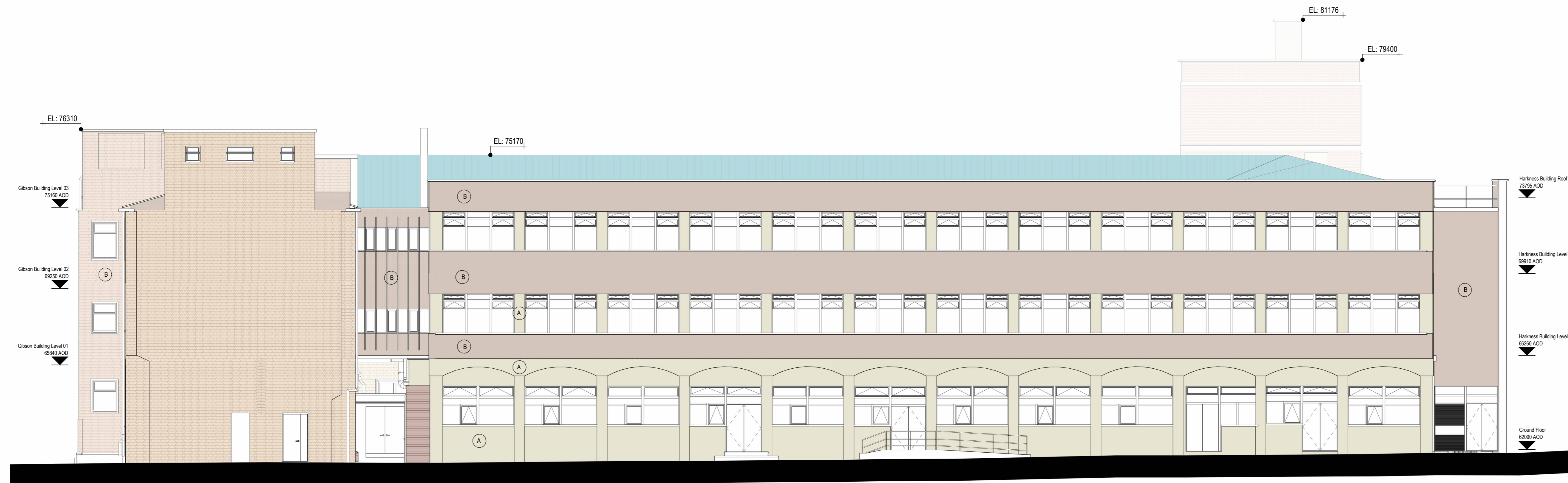
2 Existing Elevation - South 1:100