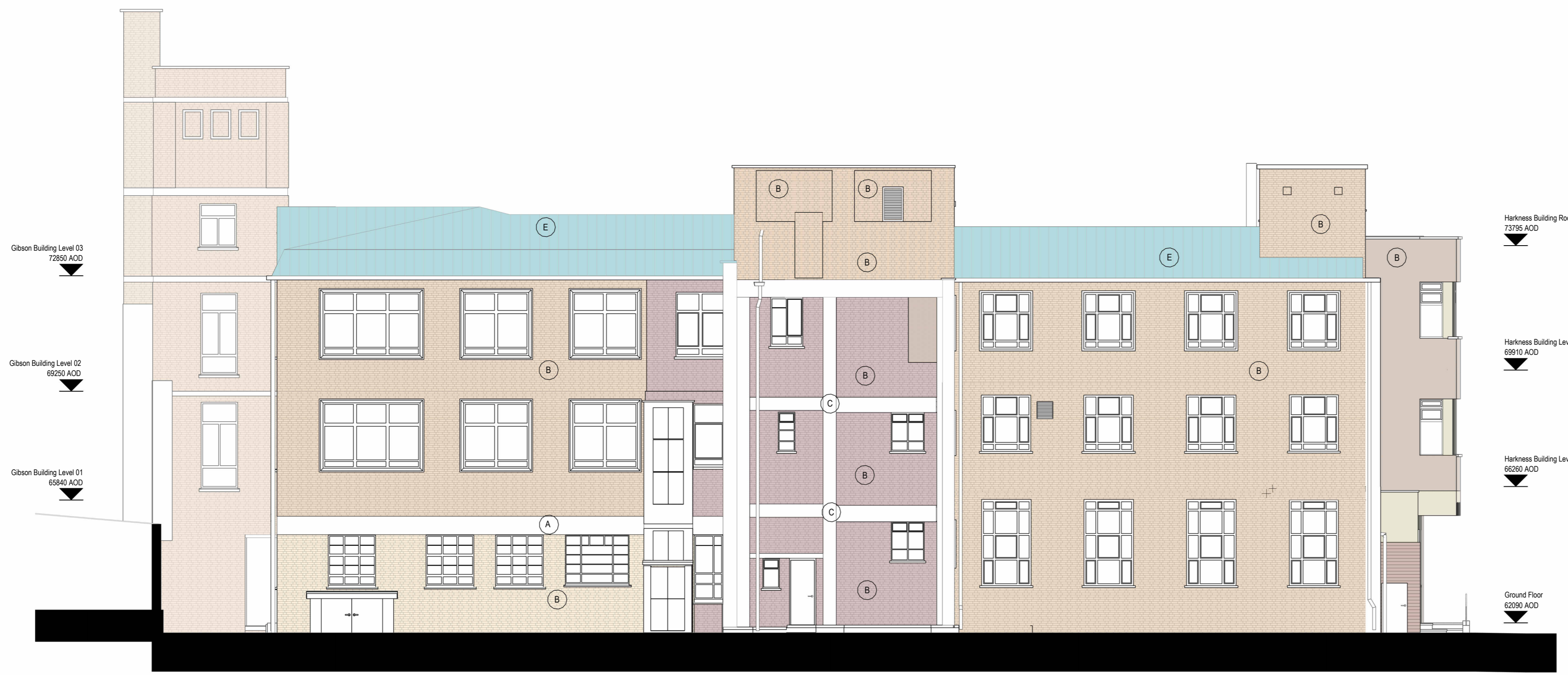
2 Existing Elevation - West 1 : 100