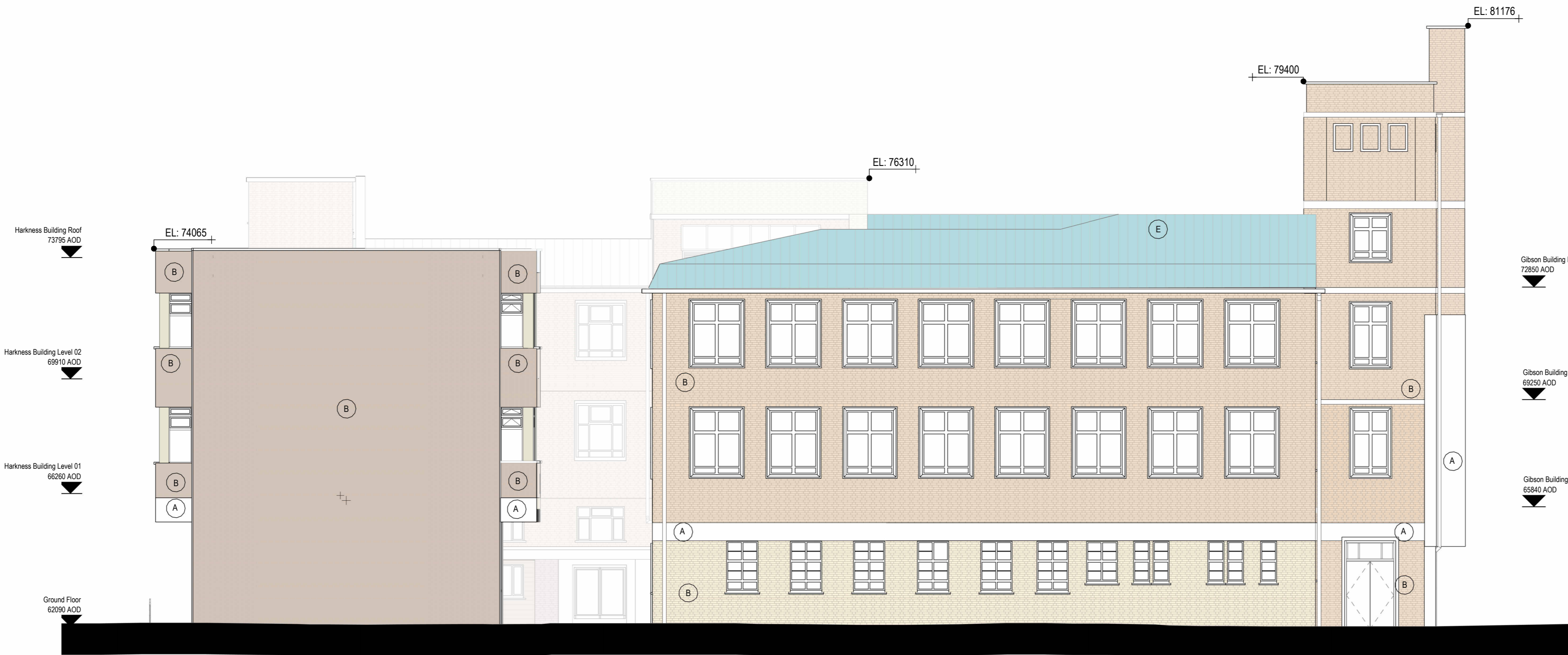
1 Existing Elevation - East 1 : 100