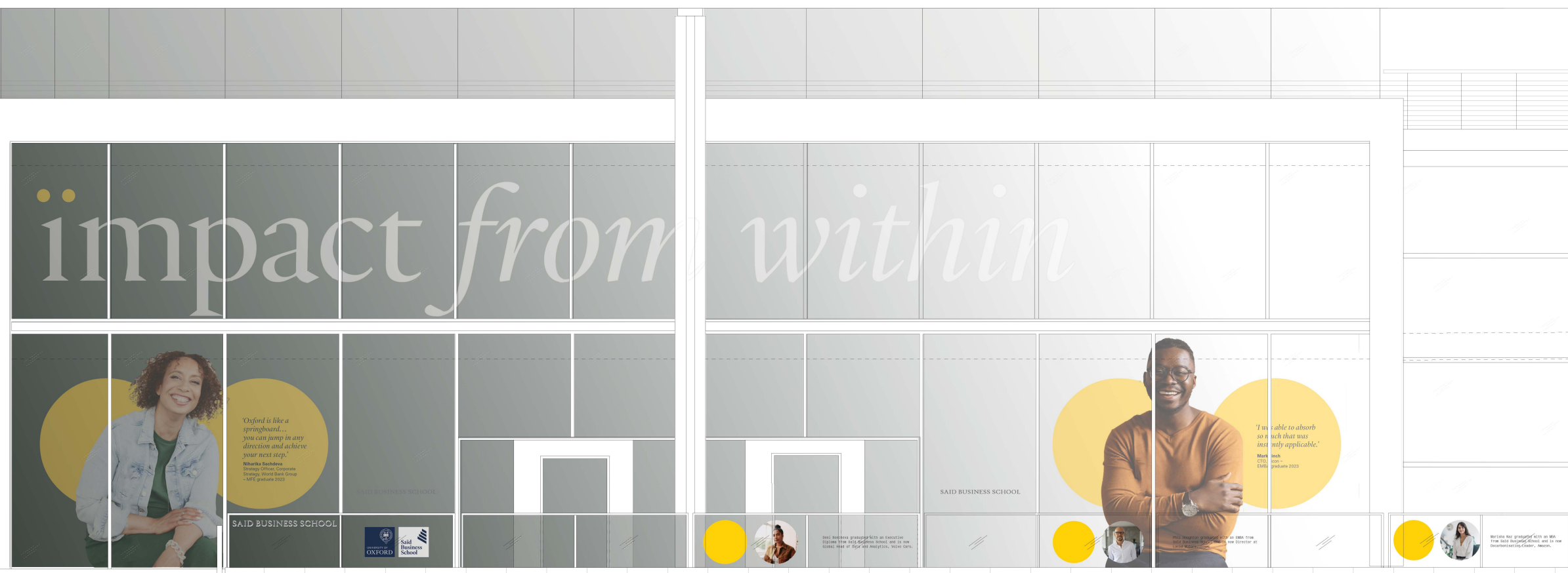
2 PROPOSED SOUTH ELEVATION ENTRANCE