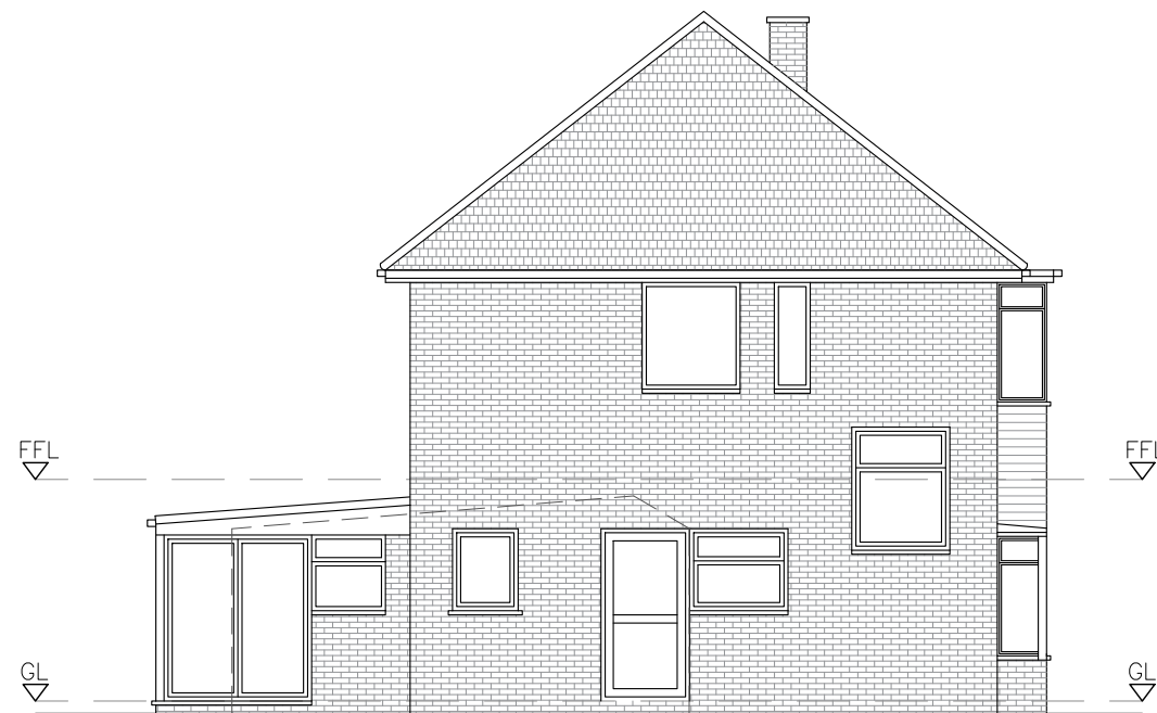
EXISTING SIDE ELEVATION (EAST)