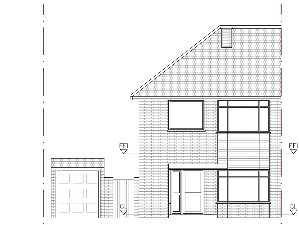
EXISTING FRONT ELEVATION (NORTH)