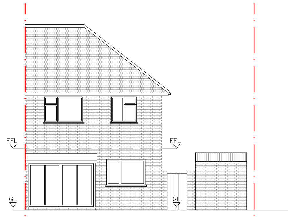
EXISTING REAR ELEVATION (SOUTH)